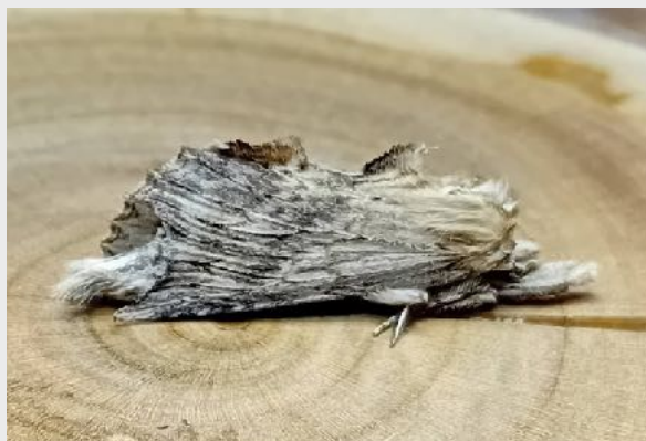
Pale Prominent