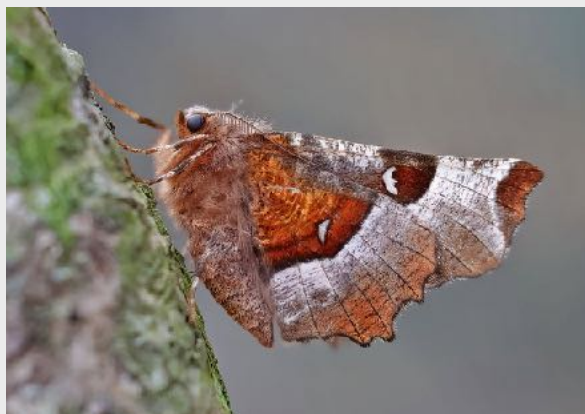
Purple Thorn