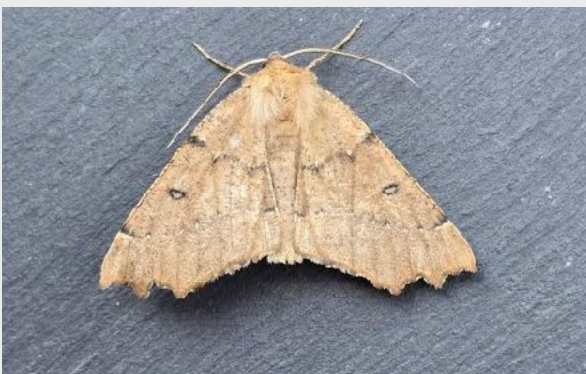
Scalloped Hazel - ©Clive Ashton