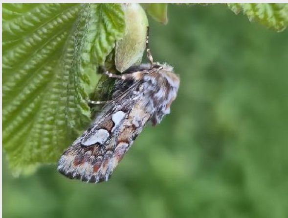
Pine Beauty - Hardwick Hall