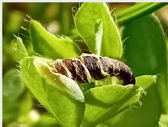
Coleophora discordella - Larval Case