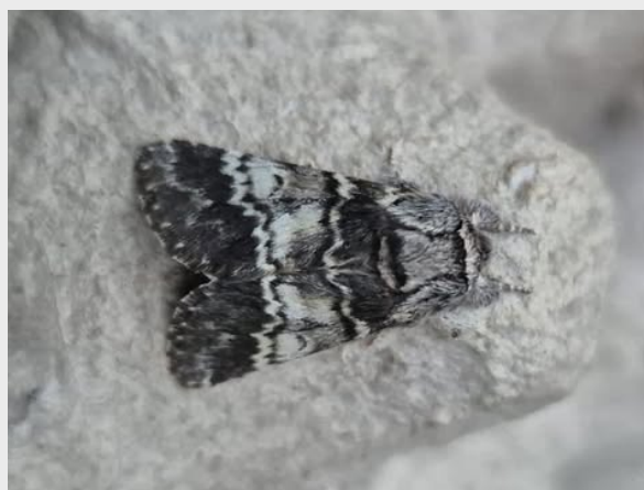
Lunar Marbled Brown - Hardwick Hall - ©Emily Milnes