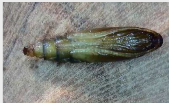
Coptotriche marginea pupa case