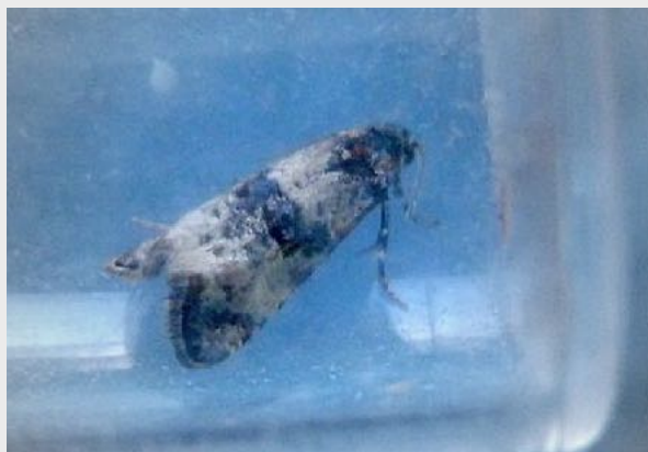
Hysterothrips maculosana