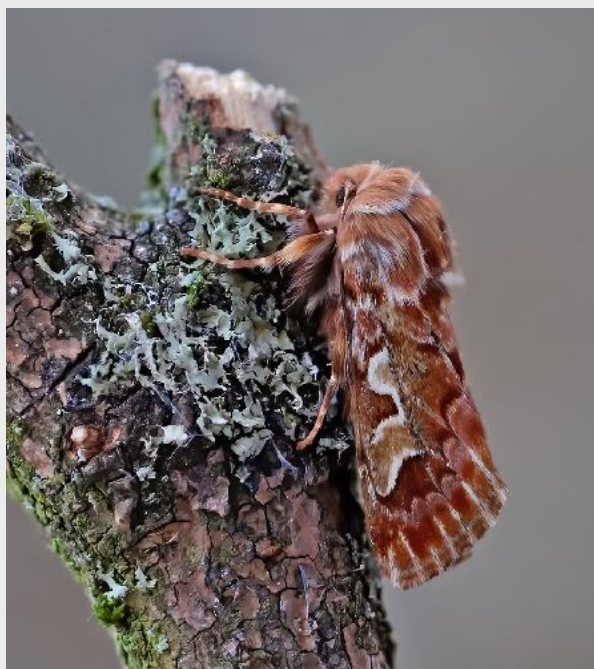
Pine Beauty