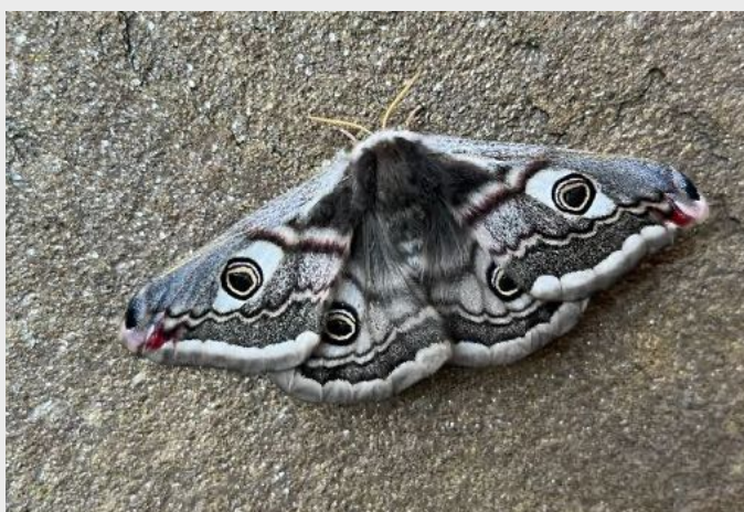
Emperor Moth - female