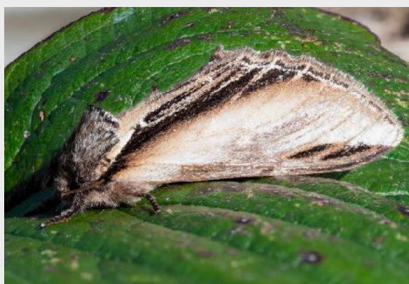
Swallow Prominent