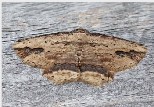
Waved Umber