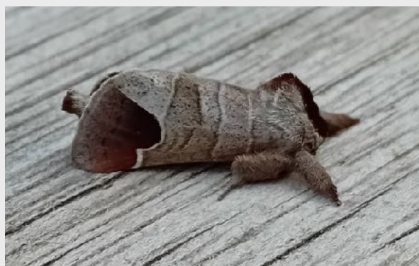
Chocolate Tip - ©Mark Radford