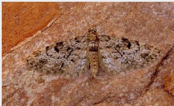
Dwarf Pug