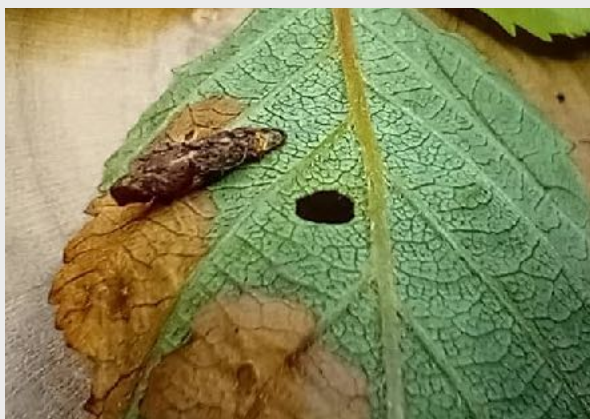
Coleophora bindarella