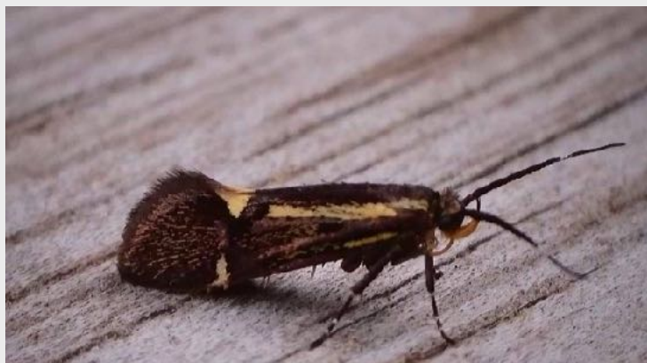
Esperia sulphurella