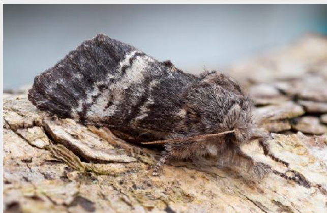
Lunar Marbled Brown