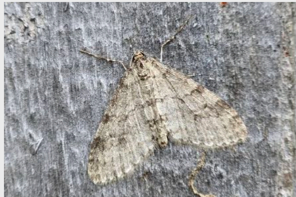
Early Tooth-striped - ©Clive Ashton

I ran my 20W Actinic in my Melbourne garden overnight on 16th and recorded Waved Umber , Purple Thorn , Common Pug and Psychoides filicivora (2) ( Common Fern Moth ) all were new for the year, with the Common Fern Moth new for the garden. Hebrew Character , Streamer and Brindled Pug made up the 8/7.