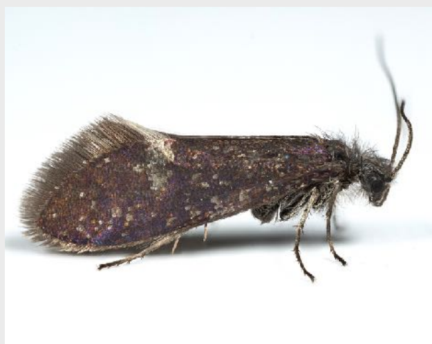
Eriocrania unimaculella