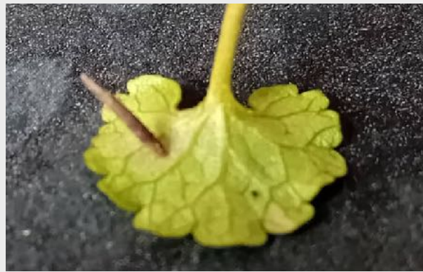
Larval Case of Coleophora albitarsella