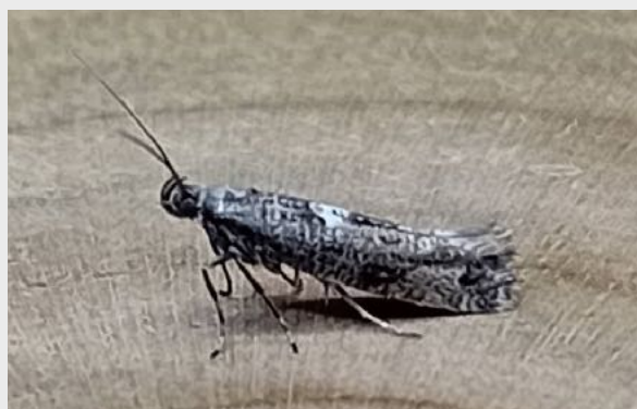
Acrolepiopsis assectella

10th April - Graham Pollock recorded the first Lesser Swallow Prominent of the year from his garden light trap in Quarndon.