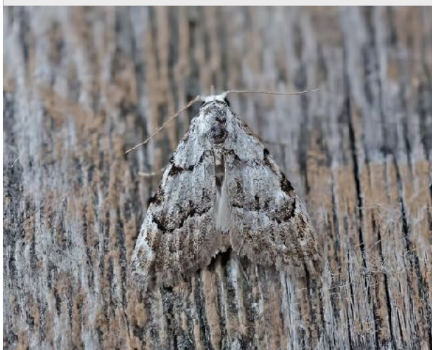
Least Black Arches