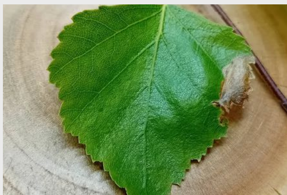
Eriocrania unimaculella