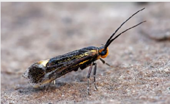
Esperia sulphurella