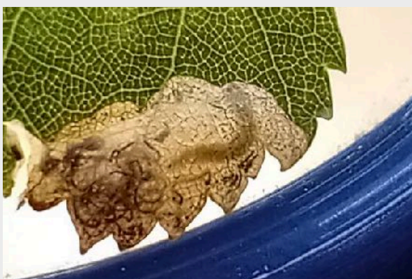
Eriocrania unimaculella