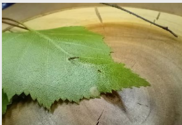
Coleophora milvipennis