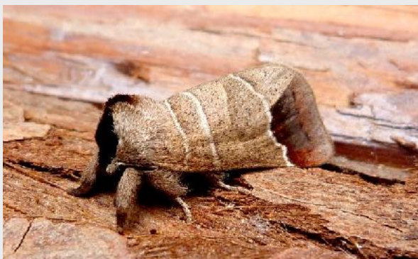
Chocolate-tip