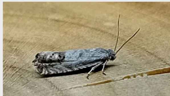
Cydia ulicetana