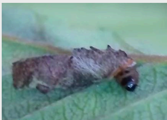
Coleophora bindarella (larva and case)