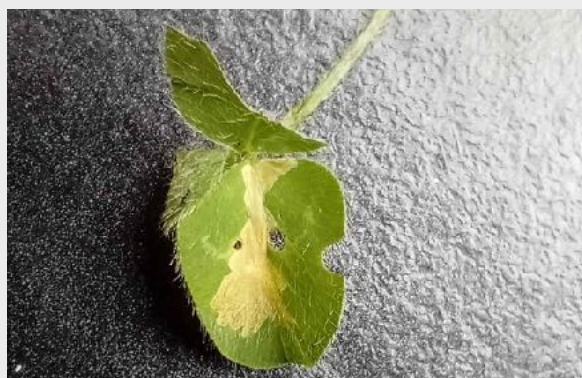
Parectopa ononidis