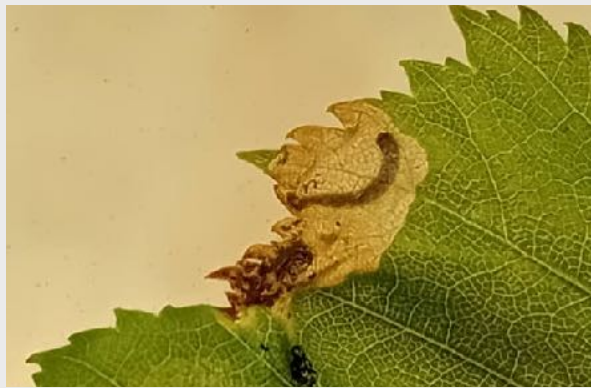
Eriocrania sangii