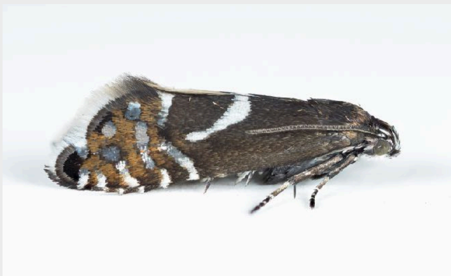
Glyphipterix haworthana