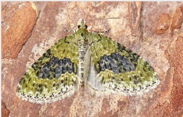
Yellow-barred Brindle