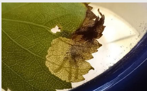
Eriocrania cicatricella