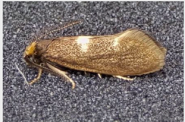
Incurvaria pectinea - ©Clive Ashton