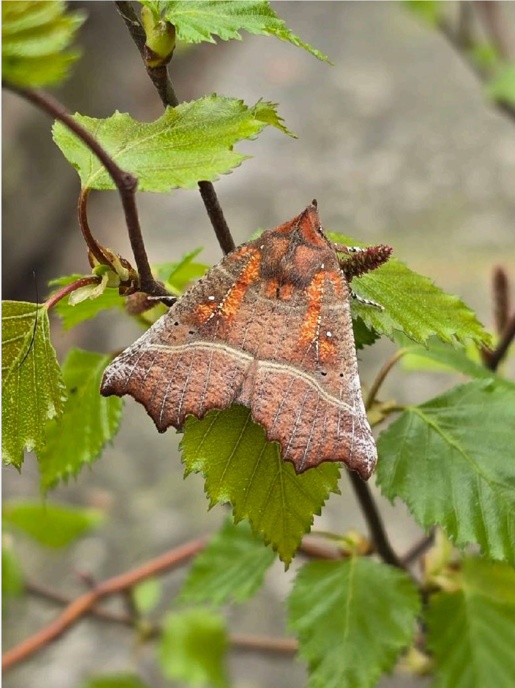
The Herald - ©Clive Ashton