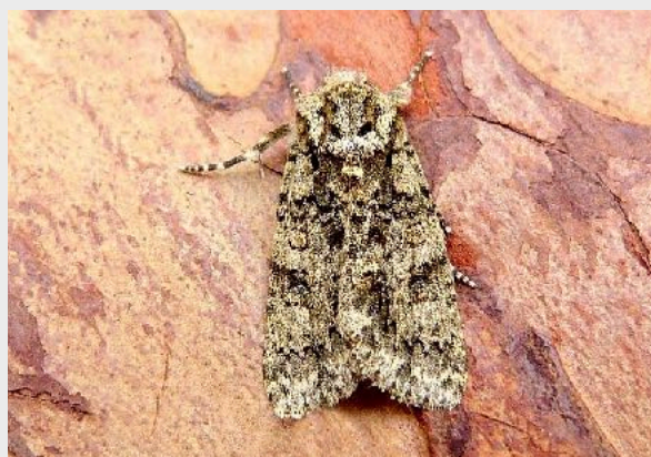
Knot Grass