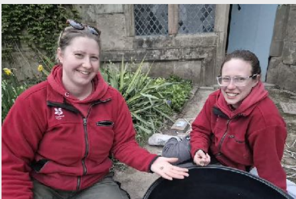
The NT Rangers enjoying their first moth trap session.