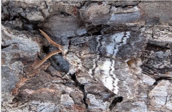
Lunar Marbled Brown