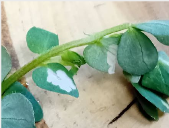
Coleophora discordella