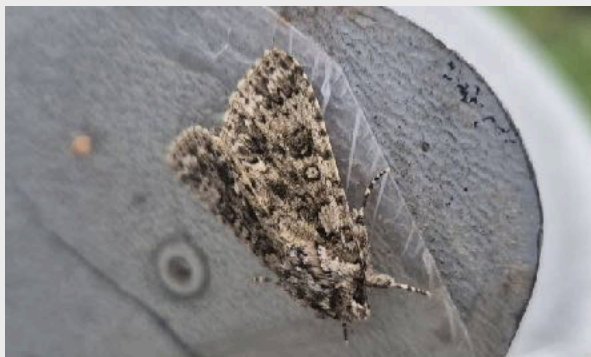
Knot Grass