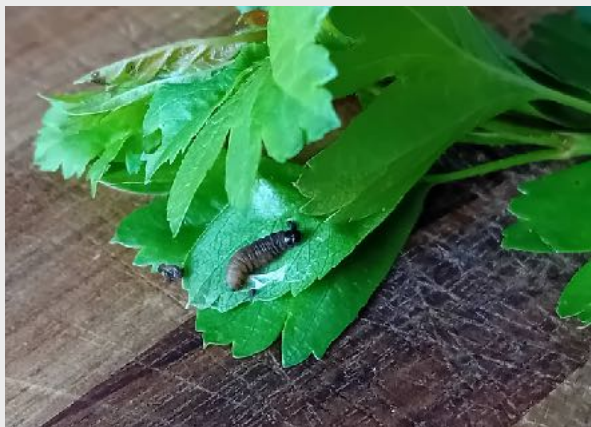
Notocelia trimaculana