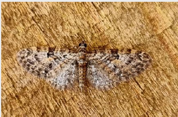
Oak-tree Pug - ©Dave Evans