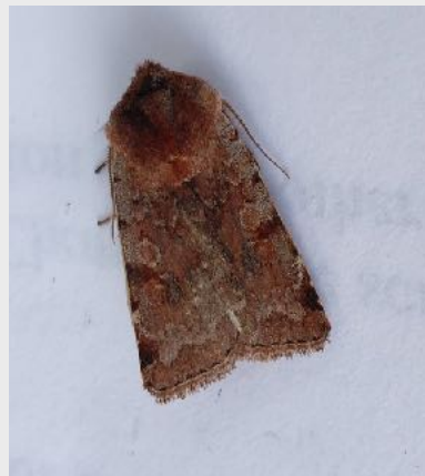
Red Chestnut