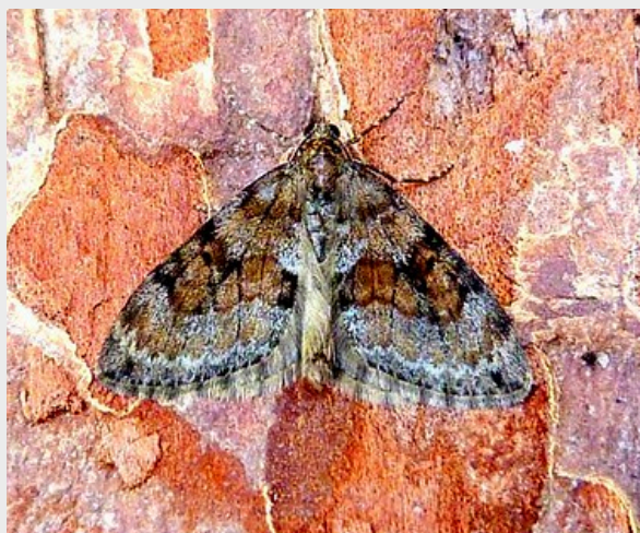
Grey Pine Carpet