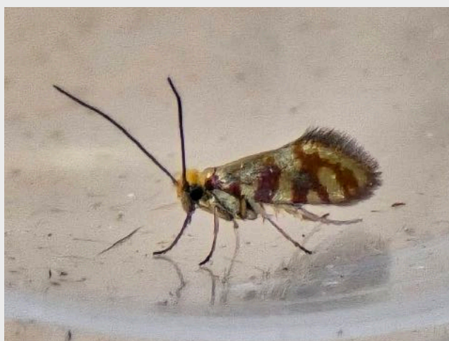
Micropterix tunbergella