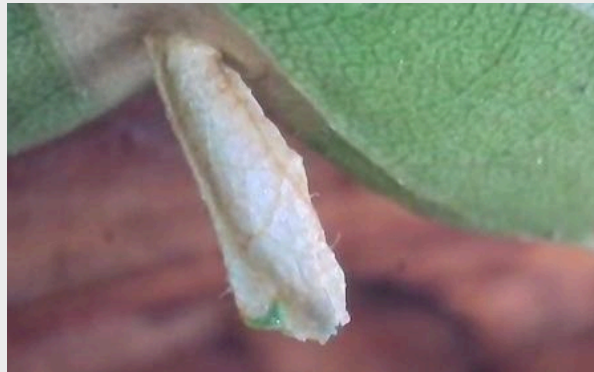
Coleophora serratella