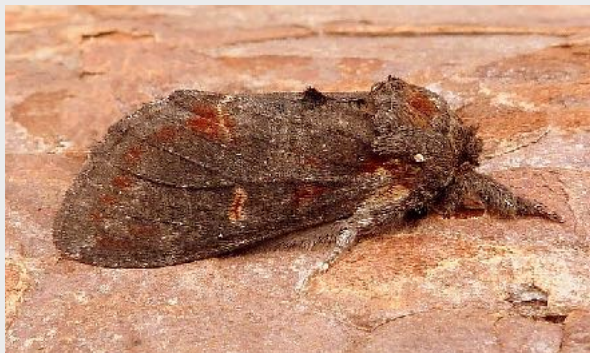
Iron Prominent - ©Dave Evans