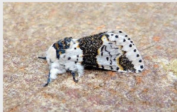
Alder Kitten