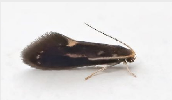
Psychoides filicivora