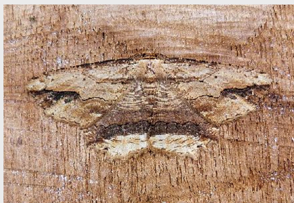
Waved Umber