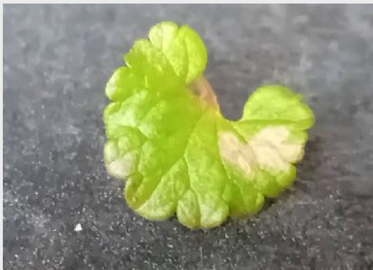
Coleophora albitarsella