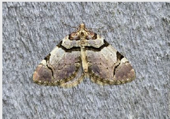
The Streamer

2nd April - Clive Ashton recorded a Streamer from Cromford. Clive also ran a light in Bow Wood, near Cromford for a few hours, producing 17/7 with a couple of highlights, Purple Thorn , Early Tooth-striped (5), Brindled Pug (6) and Oak-tree Pug . Another Oak-tree Pug from Normanton recorded by Andrew-John Shervill.