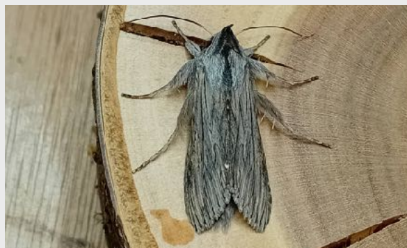
Chamomile Shark