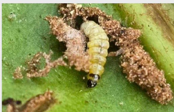
Psychoides verhuella - Larva