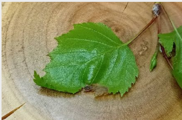
Eriocrania sangii