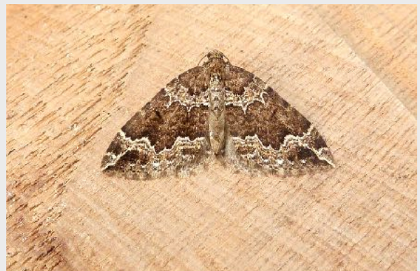
Water Carpet