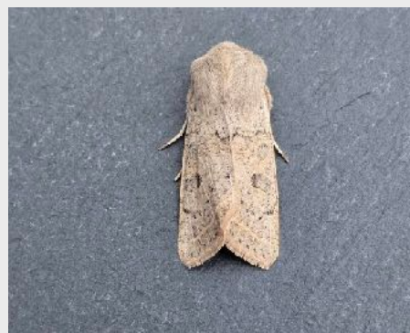
Powdered Quaker - ©Clive Ashton