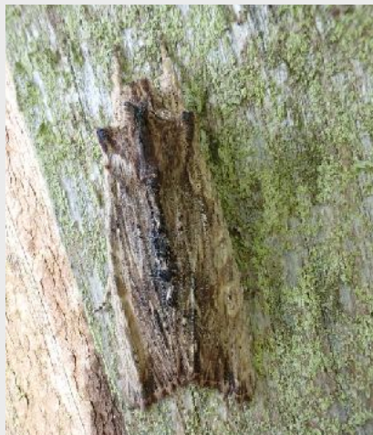
Tawny Pinion