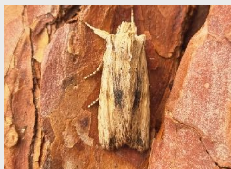
Pale Pinion