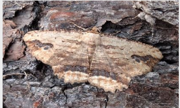
Waved Umber