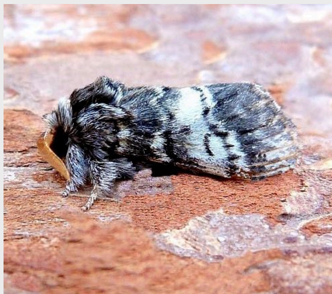
Lunar Marbled Brown