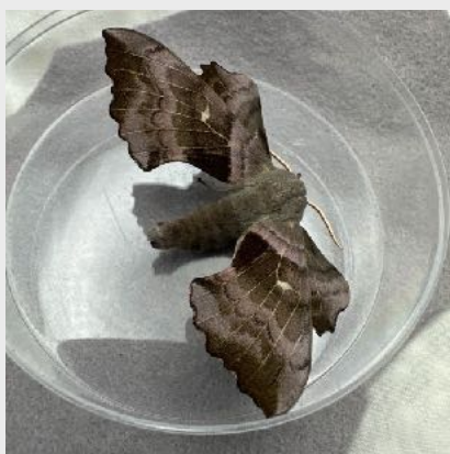
Poplar Hawk-moth