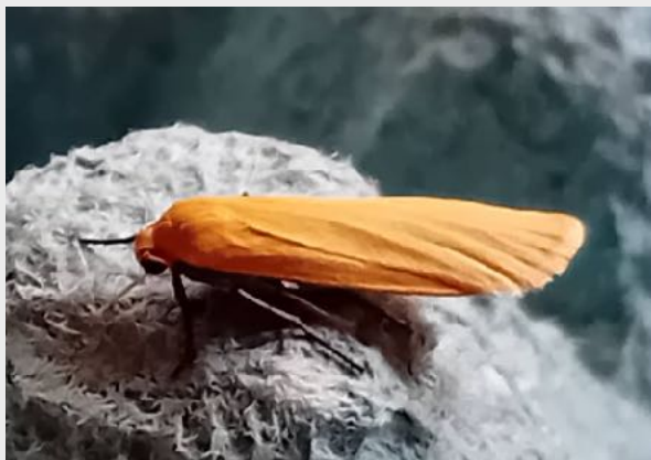
Orange Footman