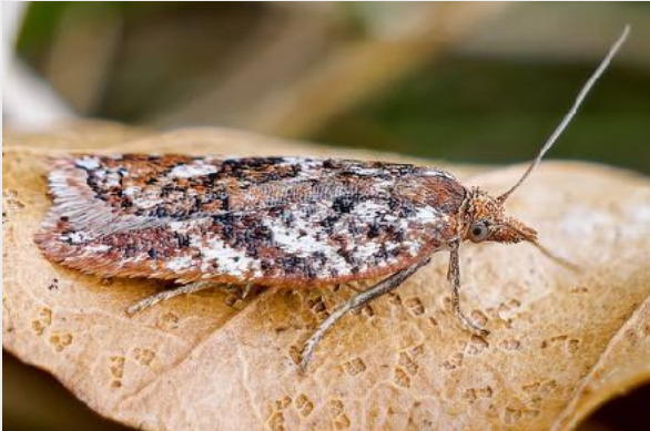
Acleris hymana - ©Ian White