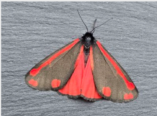
Cinnabar Moth