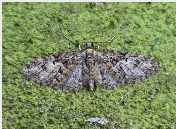
Brindled Pug