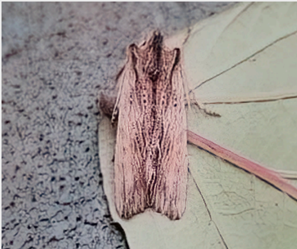
Tawny Pinion