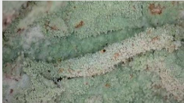
Infurcitinea argentimaculella