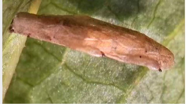
Coleophora gryphipennella - larval case