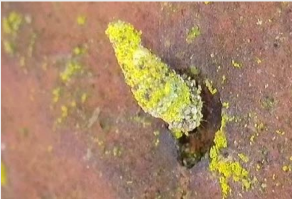
Luffia lapidella