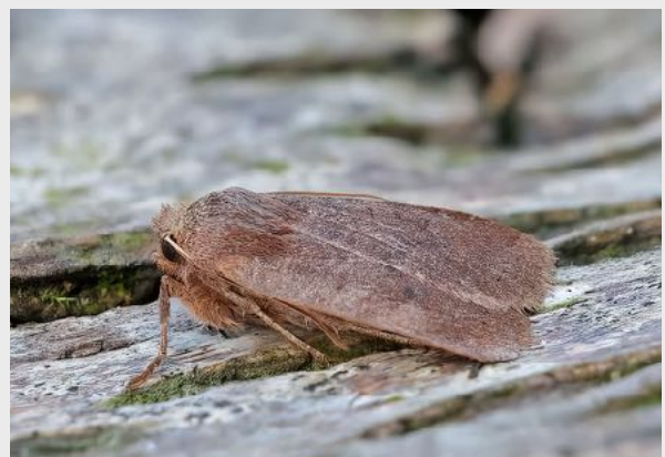
Chestnut