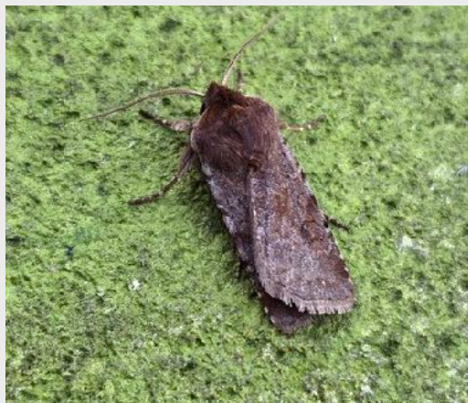
Red Chestnut