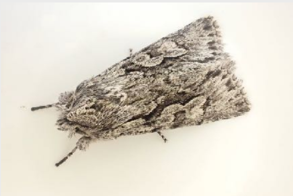
Early Grey