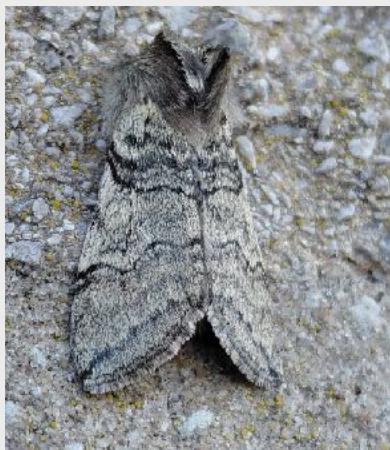
Yellow Horned