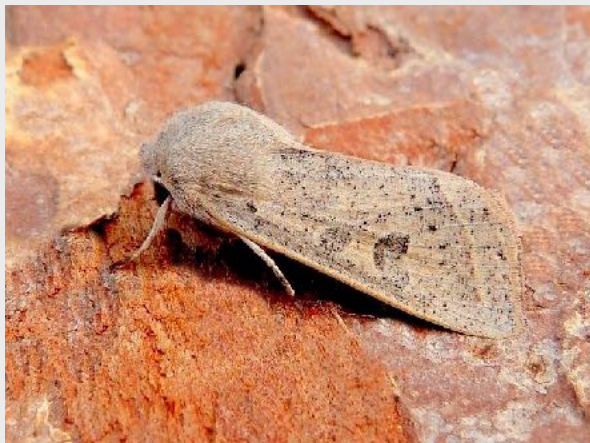
Powdered Quaker