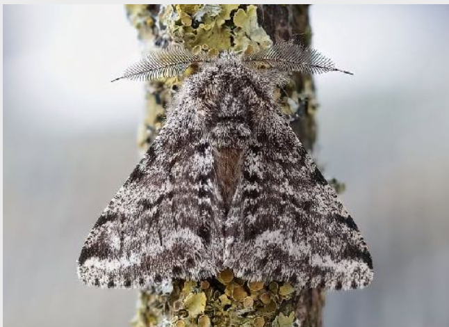
Brindled Beauty