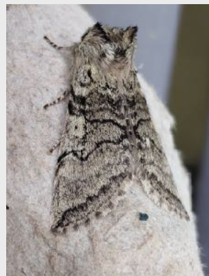
Yellow Horned