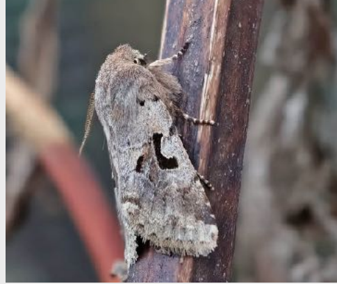
Hebrew Character