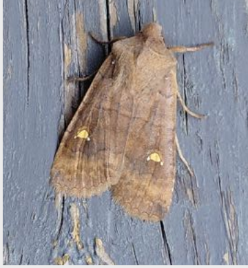
Satellite - ©John Turner