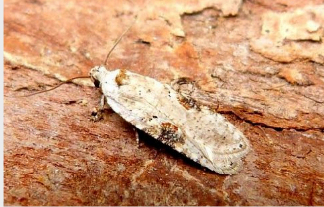
Agonopterix alstromeriana