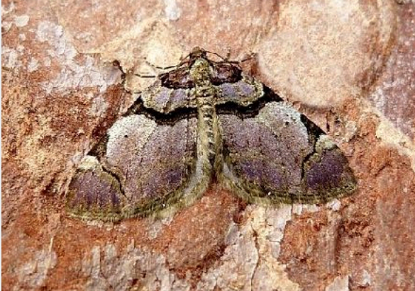
Streamer