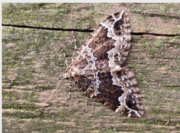
Water Carpet