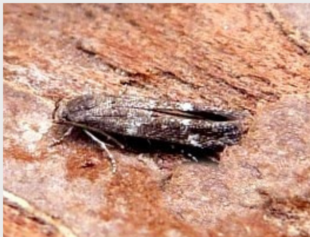
Mompha subbistrigella