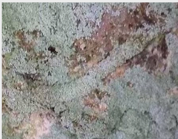
infurcitinea argentimaculella - Larval tube