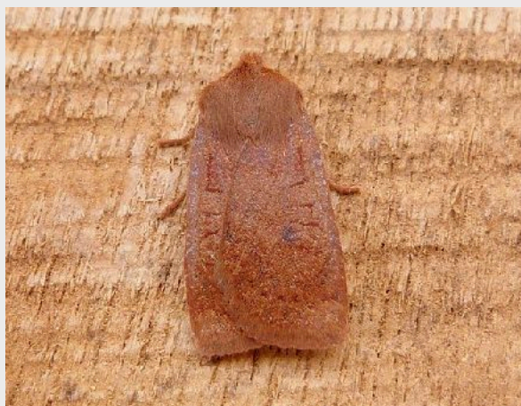
Chestnut