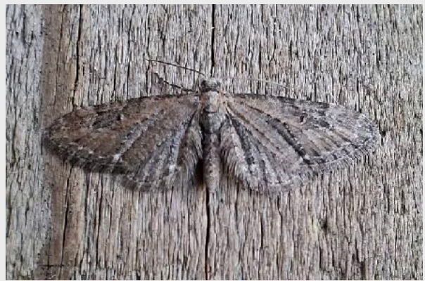
Common Pug

Mark Radford had a short moth trapping session at Markham Vale from 18:30 till 20:30 producing 71 moths of 13 species. Highlights were a Grey Shoulder-knot (new for the site); Yellow Horned (3), Shoulder Stripe , Twin-spotted Quaker (2), Small Quaker (6), Clouded Drab (13) and Oak Beauty (5). Ann Wood from Sandiacre recorded a very early Common Pug amongst a few Common Quaker and Small Quaker (3).