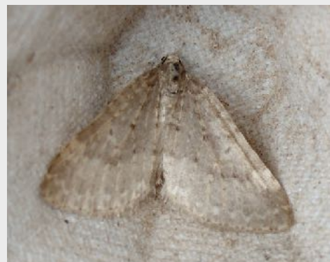
Mottled Grey - ©John Turner