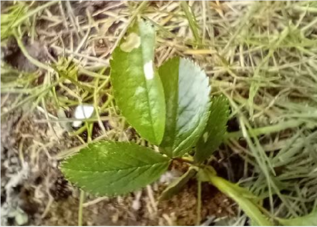
Coleophora gryphipennella - feeding damage

30th March - Mark Radford discovered an active larval case of Coleophora gryphipennella on Dog Rose at Markham Vale South Tip. After finding the feeding damage, he located the larval case on the underside of the leaf. Mark also discovered 20 Larval cases of Dahlica triquetrella spread between 10 Lime trees at Markham Vale South Tip.