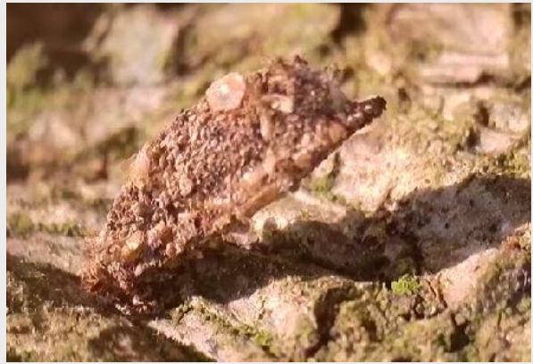
Diplodoma laichartingella