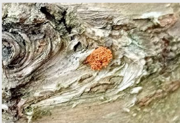
Enarmonia formosana - frass