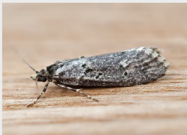
Diurnea fagella - melanic form