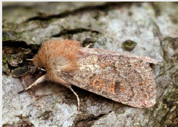
Blossom Underwing