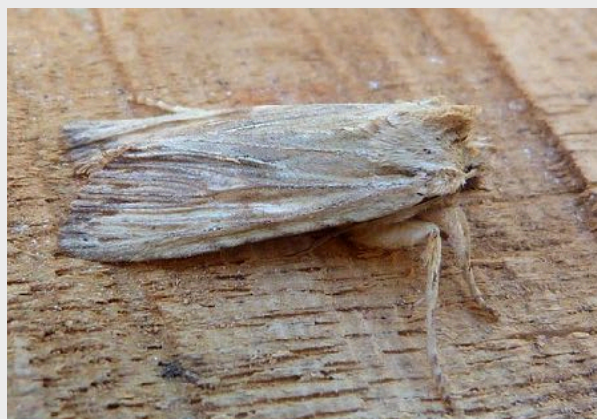
Pale Pinion