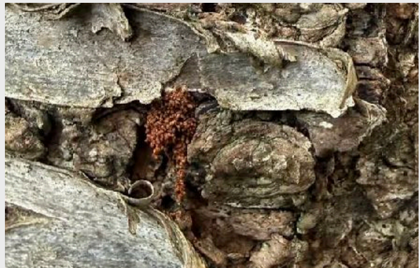
Enarmonia formosana (frass)