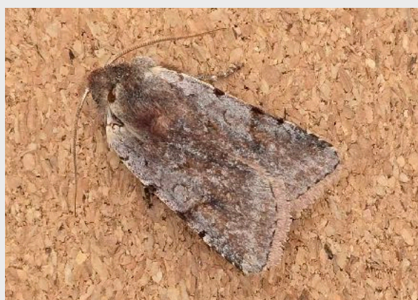
Red Chestnut