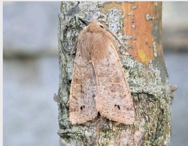
Twin-spotted Quaker