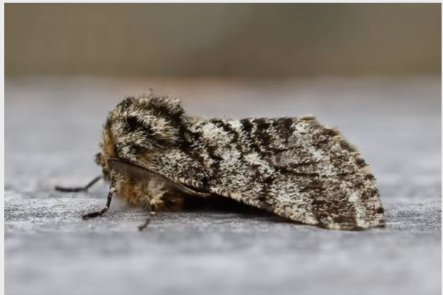
Brindled Beauty