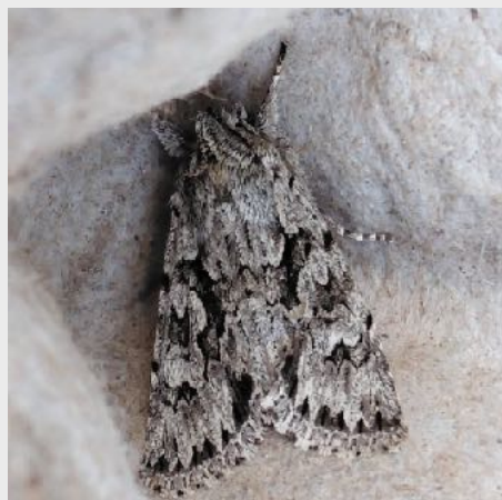
Early Grey