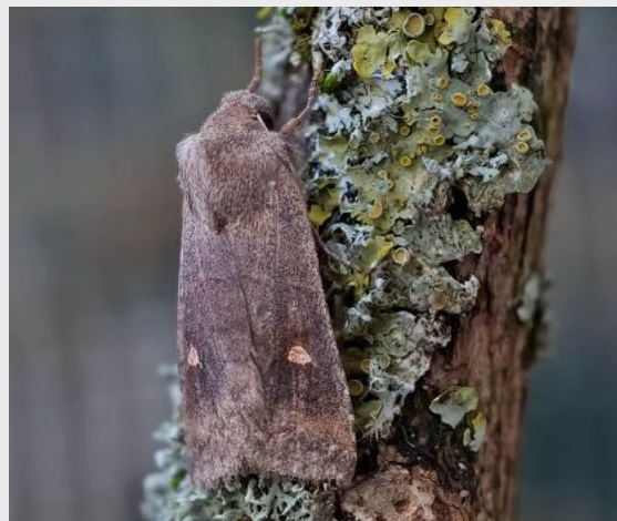
Satellite