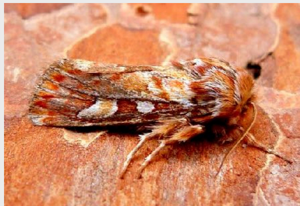
Pine Beauty