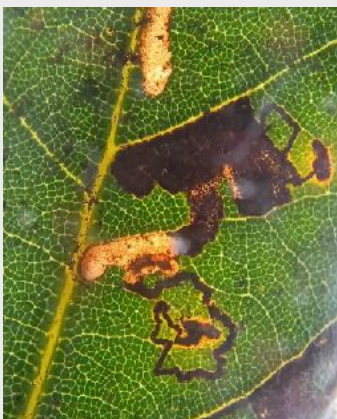
Ectoedemia heringella