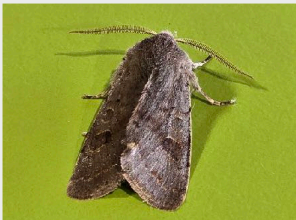
Lead-coloured Drab