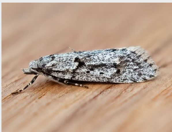
Diurnea fagella