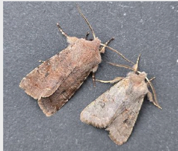
Lead-coloured Drab - ©Clive Ashton