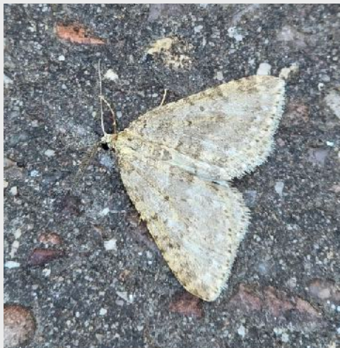
Mottled Grey