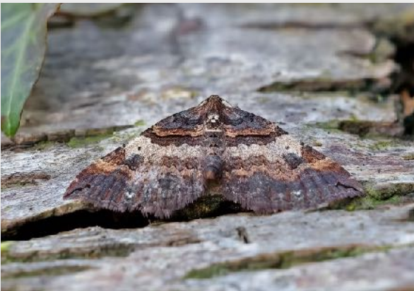
Shoulder Stripe - ©Tony Davison

Mark Radford had a short moth trapping session at Markham Vale from 18:30 till 20:30 producing 71 moths of 13 species. Highlights were a Grey Shoulder-knot (new for the site); Yellow Horned (3), Shoulder Stripe , Twin-spotted Quaker (2), Small Quaker (6), Clouded Drab (13) and Oak Beauty (5). Ann Wood from Sandiacre recorded a very early Common Pug amongst a few Common Quaker and Small Quaker (3).