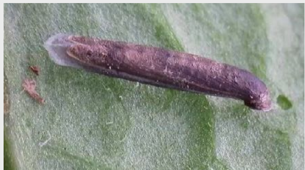
Coleophora paripennella