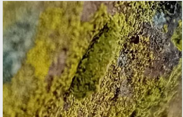
Narycia duplicella