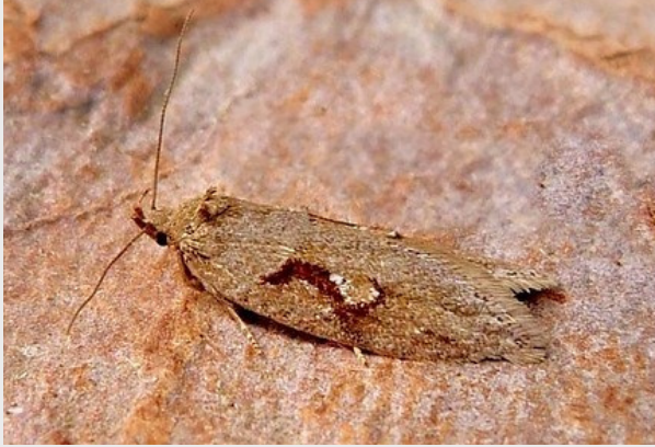
Semioscopis steinkellneriana - ©Dave Evans