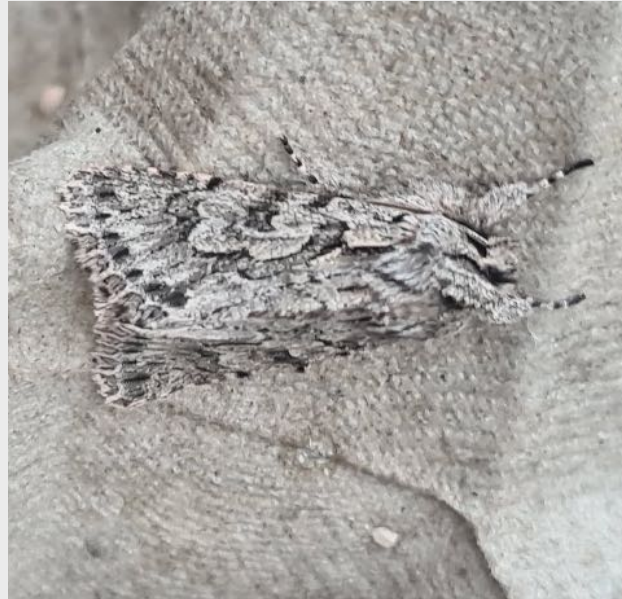
Early Grey

7th March - I ran my garden moth trap for a few hours this evening and managed a Grey Shoulder-knot (NFY), Common Quaker (14) and a single Small Quaker between 18:30 - 22:30hrs. Clive Ashton's garden light trap produced Clouded Drab (2), Satellite and Twin-spotted Quaker . John Turner from New Mills recorded 12/6 which included Yellow Horned (2). Graham Pollock from Quarndon recorded 25/4 which included a Grey Shoulder-knot and a Small Quaker .