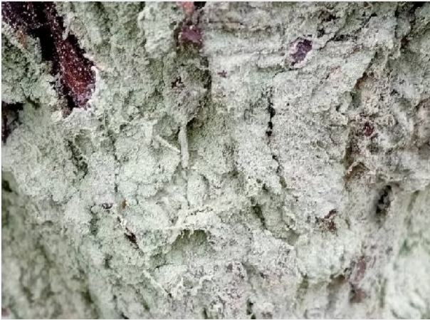
Powder lichen Lepraria incana