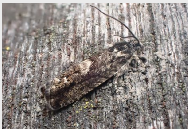
Pammene giganteana