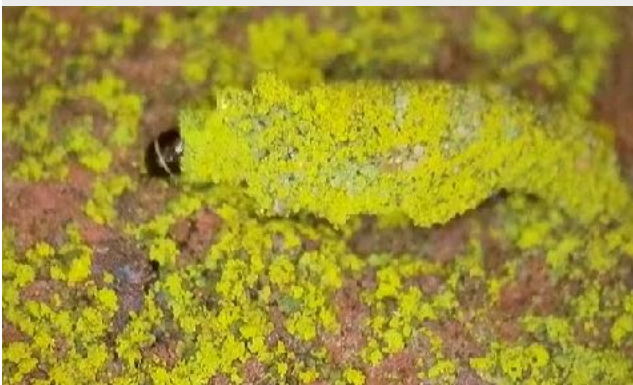
Narycia duplicella

A record that took some sorting out was from Mark Radford who discovered the larval cases of Narycia duplicella at Harland Cemetery on 9th March 2026. Four cases were found on a lichen covered brick wall, with one actively feeding. The cases sported the characteristic “fins” at the rear of the case.