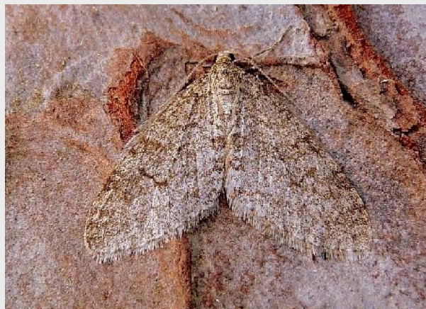
Early Tooth-striped

The Markham Vale Crew deployed six traps overnight on 17th recording 219/22 including highlights of Water Carpet (2), Shoulder Stripe (7), Twin-spotted Quaker (4), Common Quaker (138), Yellow Horned (1), Red Chestnut (1), Pammene giganteana (1), Agonopterix ocellana (1) and Acleris cristana (1).