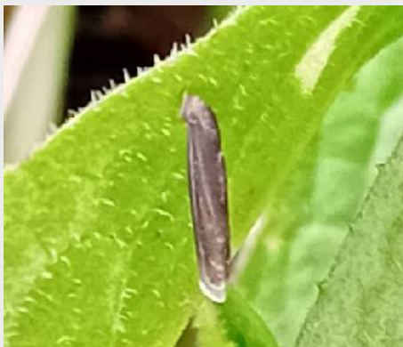
Coleophora paripennella