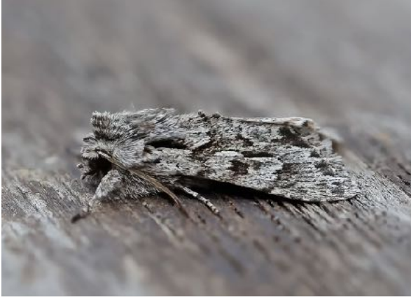
Early Grey