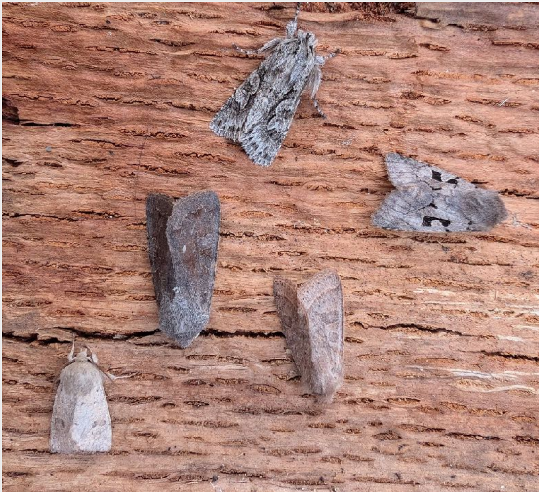
Spring Moths