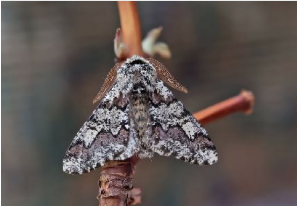
Oak Beauty