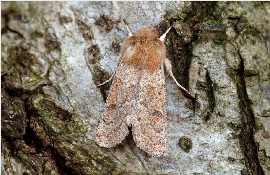
Blossom Underwing - 23rd March 2026 - ©Martin Roome - 4th record for VC57