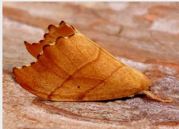
Scalloped Hook-tip