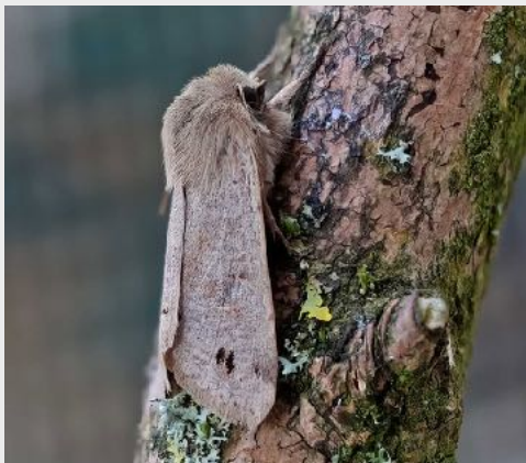
Twin-spotted Quaker