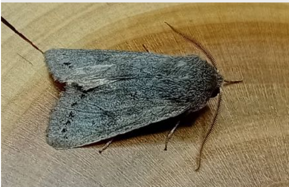
Lead-coloured Drab