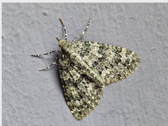
Autumn Green Carpet