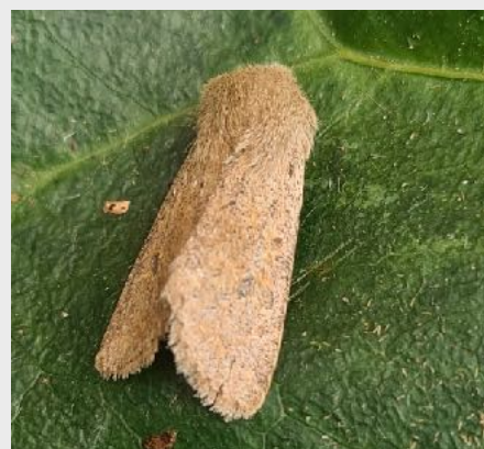
Small Quaker - ©Brian Hobby