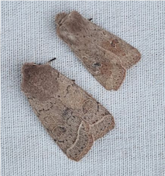
Common and Small Quaker comparison

6th March - Brian Hobby ran his trap for the Garden Moth Scheme (GMS) recording 34/5 which included Common Quaker (16), Small Quaker (8), Early Grey and Twin-spotted Quaker .