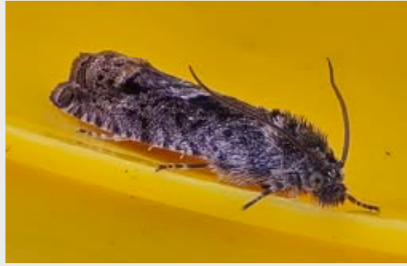
Pammene giganteana

A record that took some sorting out was from Mark Radford who discovered the larval cases of Narycia duplicella at Harland Cemetery on 9th March 2026. Four cases were found on a lichen covered brick wall, with one actively feeding. The cases sported the characteristic “fins” at the rear of the case.