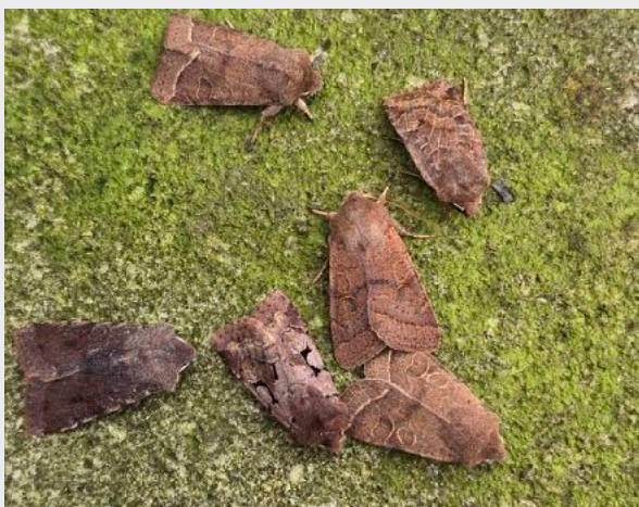
A nice assortment 2nd March