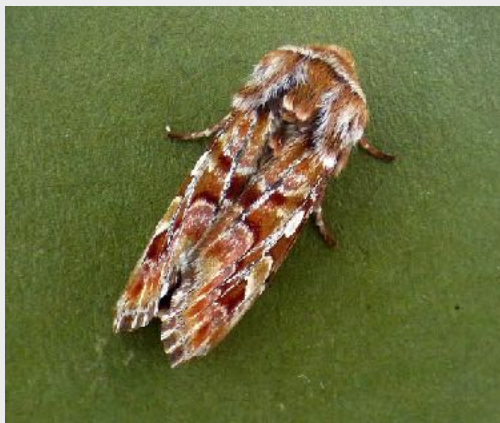
Pine Beauty