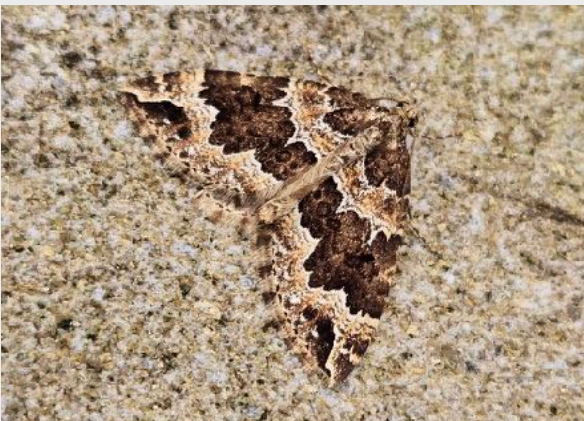
Water Carpet