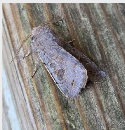
Lead-coloured Drab