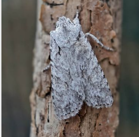
Grey Shoulder-knot