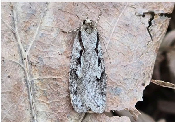
Semioscopis avellanella