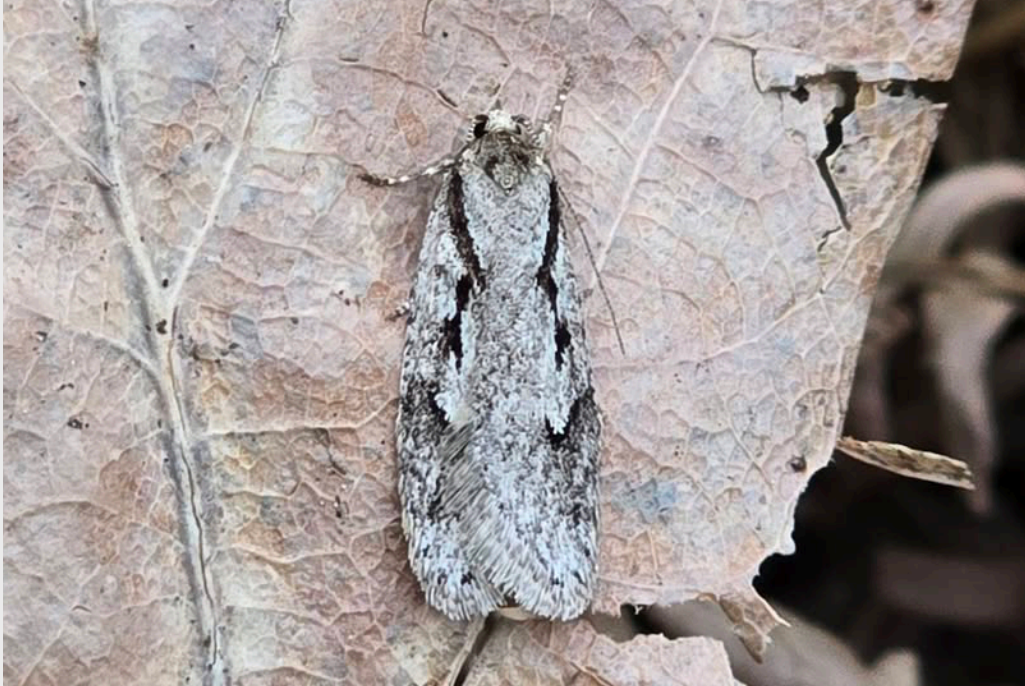
Semioscopis avellanella - 23rd March 2026