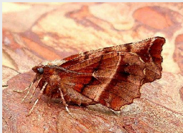
Early Thorn