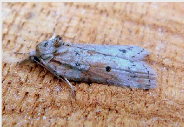
Oak Nycteoline