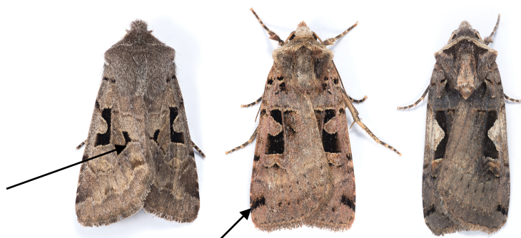
Hebrew Character - Double Square-spot - Setaceous Hebrew Character