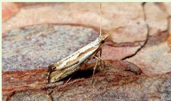
Plutella porrectella - Dave Evans©