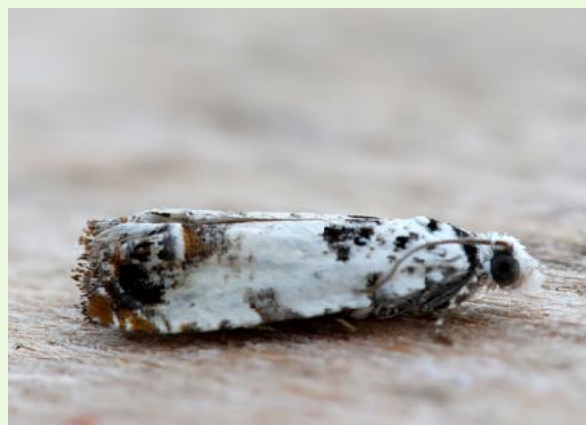
Eucosma campoliliana