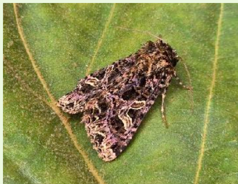
Campion - Clive Ashton©