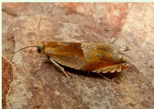
Ancylis mitterbacheriana