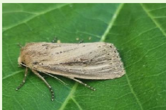
Bulrush Wainscot