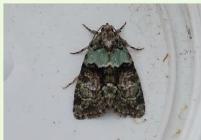
Tree Lichen Beauty - Anne Butler©