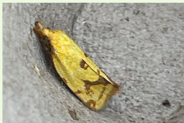
Agapeta hamana