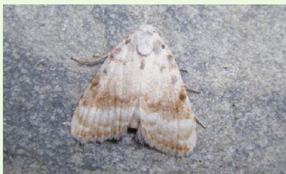
Kent Black Arches

News came in of a new macro moth for VC57, a Kent Black Arches which was trapped at Drakelow WR on 28th June. For some reason the moth was verified by another county recorder so slipped through our net.