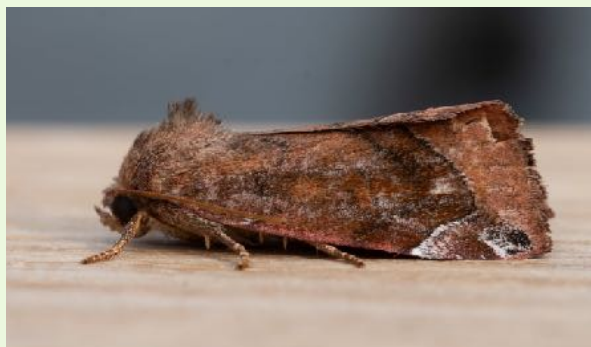
Lunar Spotted Pinion

Neil Loverock recorded 180/53 on 13th from his Chaddesden garden which included a Lunar Spotted Pinion (the first since 2020), Tree Lichen Beauty (a new location) and Least Yellow Underwing .