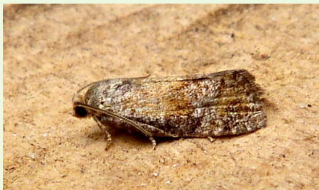
Ptycholoma lecheana