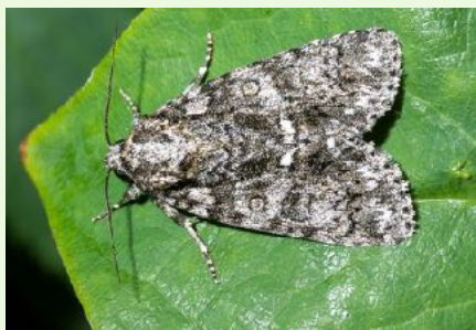
Knot Grass - Neil Ward©