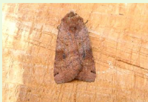
Dotted Clay - Dave Evans©