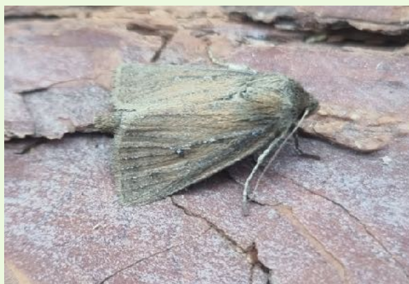
Twin-spotted Wainscot