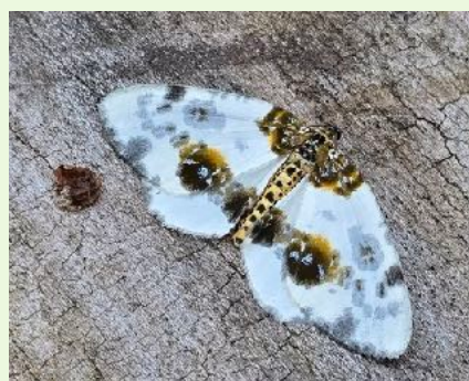
Clouded Magpie