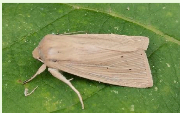
Southern Wainscot