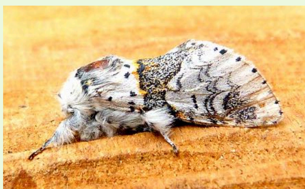
Sallow Kitten - Dave Evans©