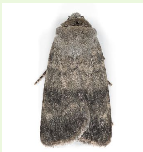
Northern Rustic

Christian trapped at 500 metres up on the moors above Glossop and recorded Northern Rustic , along with a range of other moorland species, Northern Eggar , Twin-spot Carpet , Chevron , Ruby Tiger , True-Lovers Knot , Scarce Silver Y and strangely 220 Large Yellow Underwing and 34 Broad-bordered Yellow Underwing . Christian made the comment, “as these two species are said to favour woodland, it appears they also like moorland, or do the two species have migratory tendencies?”