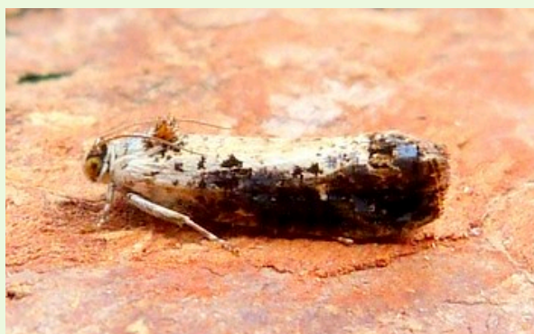
Hedya salicella