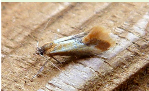
Batia lunaris