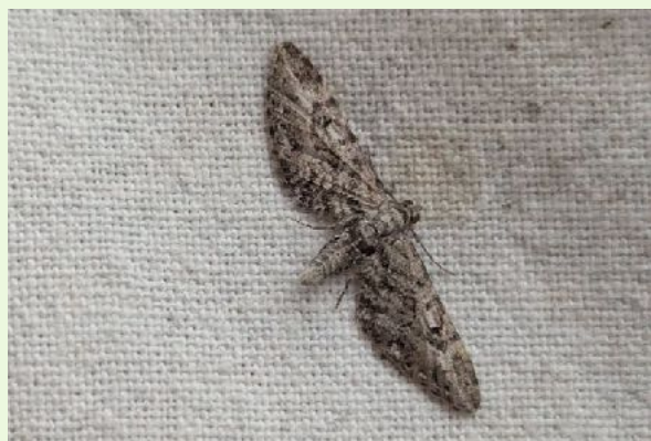
Narrow-winged Pug