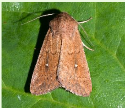
White-point - Neil Ward©

July Moth News - A report from Neil Ward arrived today, which showed some results of the moth night at Rosliston Forestry Centre, Friday 25th July. Conditions were excellent with 100's of moths turning up at the traps. A few migrants were 2 Dark Swordgrass , 2 White Point , 2 Dark Spectacle and Diamond-back Moth , together with 2 Pine Hawk-moth , Sallow Kitten and Knot Grass . The best moth of the night was a single Cream-bordered Green Pea , a new location for this species in the county.