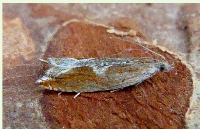
Ancylis geminana