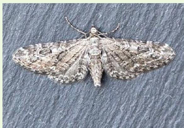
Narrow-winged Pug