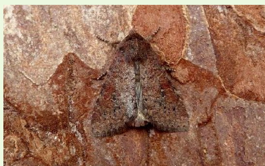
Suspected - Dave Evans©

Brian Hallam from Findern had a good but small catch overnight on 4th in windy conditions, recording Palpita vitrealis (Olive-tree Pearl), Least Carpet , Brown-tail , Nutmeg and Least Yellow Underwing . Another Palpita vitrealis was recorded on 30th June at Midway (iRecord).