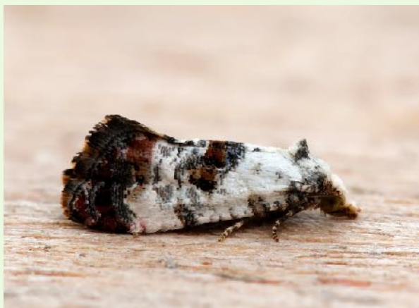
Neocoxyliis hybridella