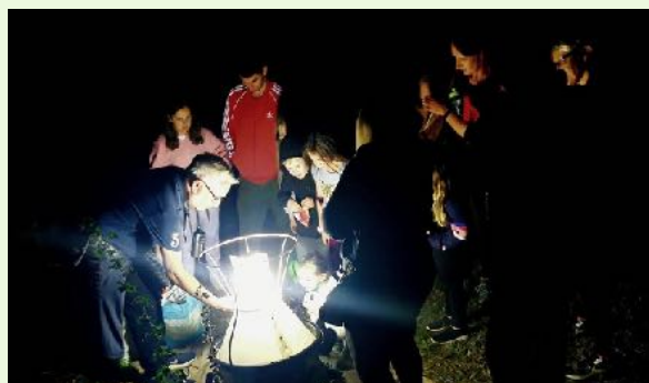
Mothing at Waingroves

There is a moth trapping event taking place at Waingroves Community Woodland on August 16th as part of their annual Moth & Bat night. I have made an offer to help out with the event, but waiting for a response, so if anyone wants to come along and help me out please get in touch.