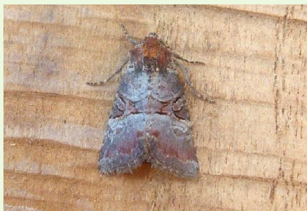
Rosy Minor