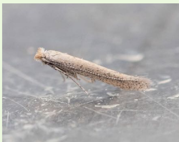
Bedellia somnulentella