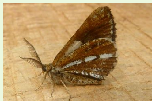
Bordered White