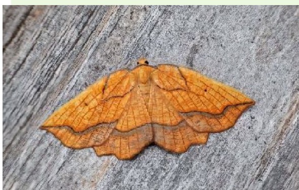
Bordered Beauty