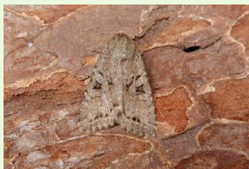
Dingy Shears