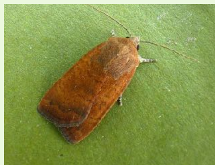
Least Yellow Underwing