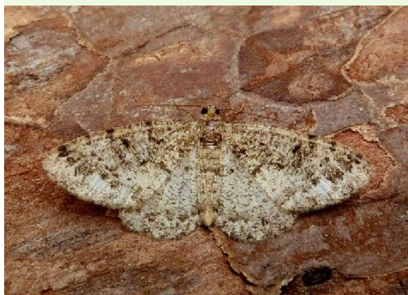
Brindled White-spot - Dave Evans©