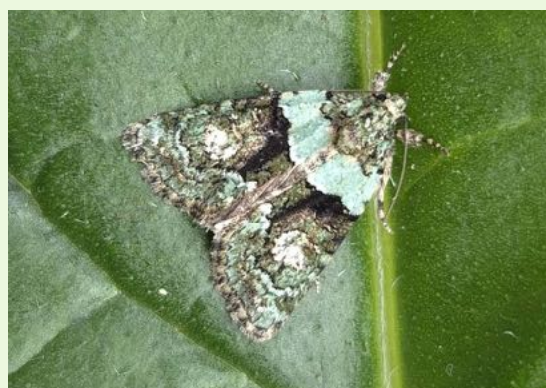
Tree Lichen Beauty - Emily Milnes©

Neil Loverock recorded 180/53 on 13th from his Chaddesden garden which included a Lunar Spotted Pinion (the first since 2020), Tree Lichen Beauty (a new location) and Least Yellow Underwing .