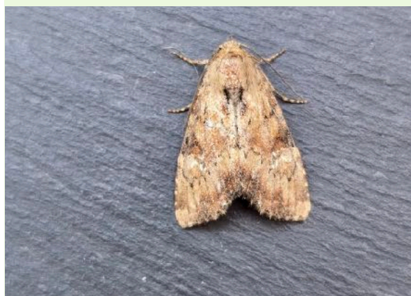
Slender Brindle