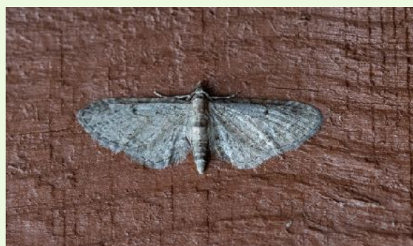
Slender Pug - Neil Loverock©