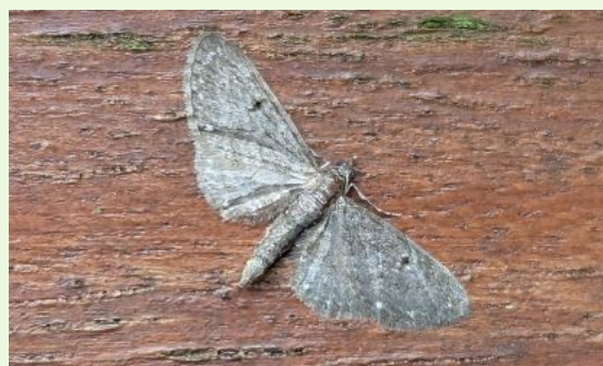
White-spotted Pug - Nikki Barrow©