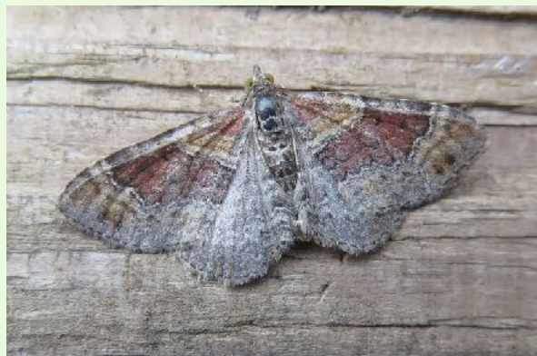
Red Twin-spot Carpet