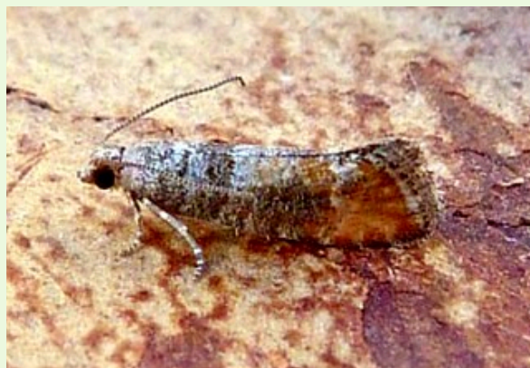
Clavigesta purdeyi

There is a moth trapping event taking place at Waingroves Community Woodland on August 16th as part of their annual Moth & Bat night. I have made an offer to help out with the event, but waiting for a response, so if anyone wants to come along and help me out please get in touch.