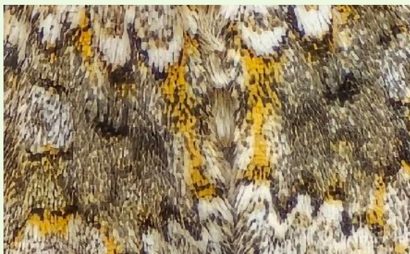
Small Ranunculus