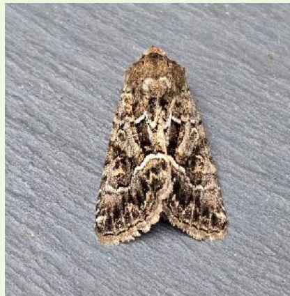
Straw Underwing - Clive Ashton©

Nikki Barrow ran her Shirland light trap overnight on 11th, with 64 species including Slender Pug , Pebble Hook-tip , White-spotted Pug and Silver Y . Graham Pollock from Quarndon recorded 261/41 from his garden light trap including Black Arches , Burnished Brass , Campion , Knot Grass and Oak Hook-tip .