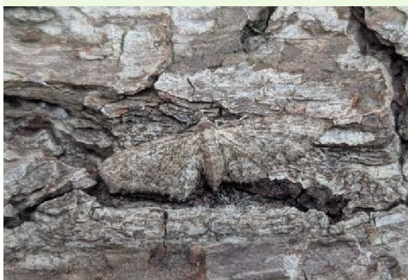
Maple Pug