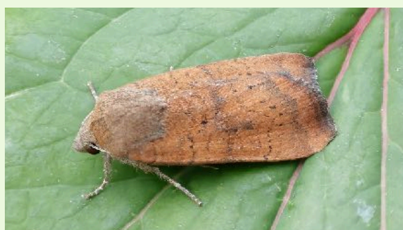
Least Yellow Underwing