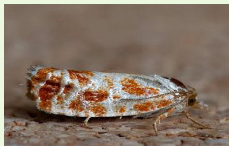
Rhyacionia pinicolana