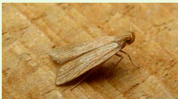
Helcystogramma rufescens