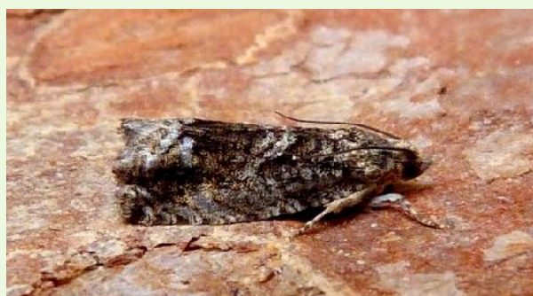
Cydia fagiglandana