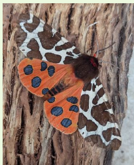
Garden Tiger