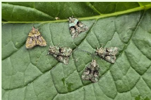
Tree Lichen Beauty