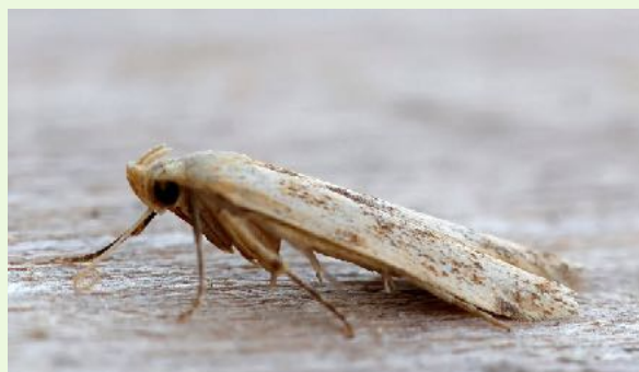
Blastobasis lacticolella

Martin Roome recorded the micro Blastobasis lacticolella from Sinfin Moor Wetlands on 3rd, from 80/46 and also Least Carpet , Neocochylis hybridella ( White-fronted Straw ), Large Twin-spot Carpet , Lobesia abscisana ( Thistle Marble ), Coleophora paripennella ( Bronze Case-bearer ), Eucosma campoliliana ( Pied Tortrix ), Eucosma cana ( Hoary Tortrix ).