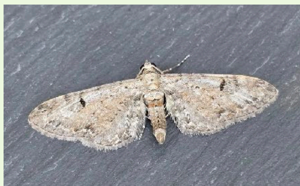
Pimpinel Pug - Clive Ashton©

Dave Evans ran his garden mv light trap on 11th recording 401/93 including highlights of Double Lobed , Old Lady , Lesser Broad-bordered Yellow Underwing , Ear Moth agg, Batia lunaris Ptycholoma lecheana and Prays fraxinella .