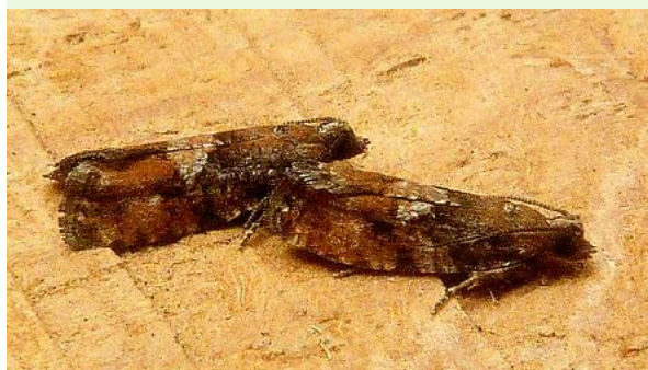
Zeiraphera ratzeburgiana