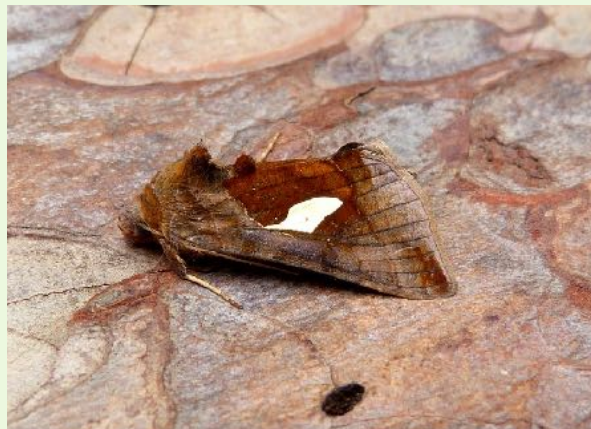
Gold Spangle