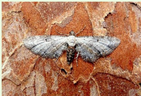
Bordered Pug