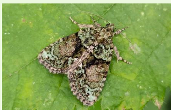
Tree Lichen Beauty