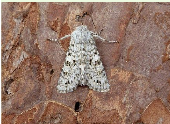
Grey Chi - Dave Evans©