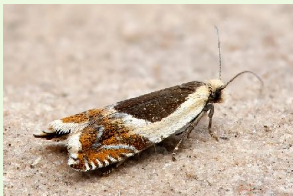
Ancylis badiana