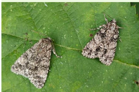
Poplar Grey (left) & Knotgrass