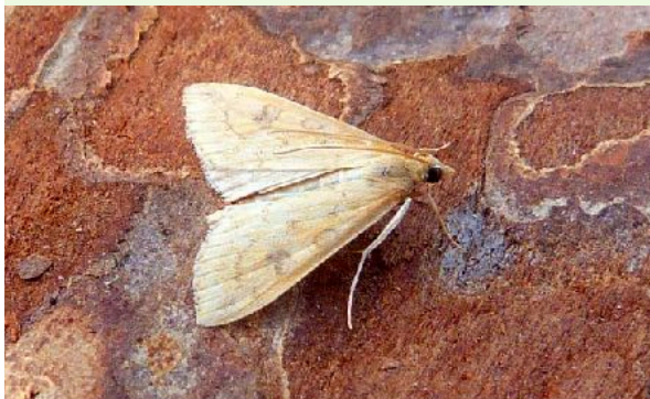
Rusty Dot Pearl - Dave Evans©