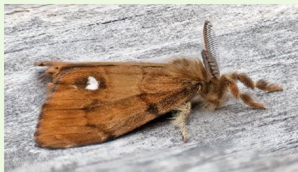
Vapourer male

I ran my Melbourne garden light trap on 13th and recorded one of the best catches I've ever had in over 20 years trapping here - 218/70 - highlights were Caloptilia robustella , Crassa unitella , Catoptria pinella , Metalampra italica , Eucosma conterminana , Large Tabby, Lychnis, Least Carpet (6), Vapourer, Least Yellow Underwing and Dusky Sallow.