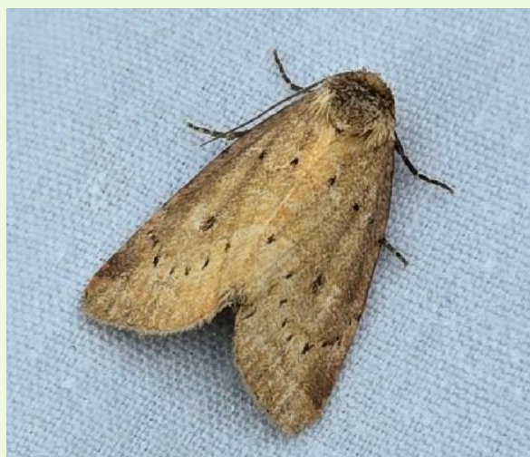
Small Dotted Buff