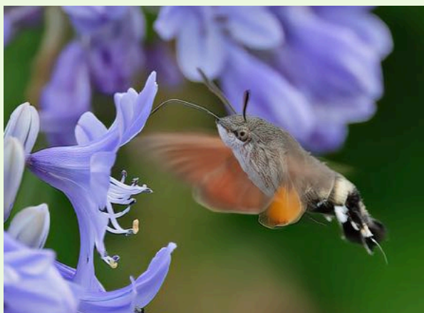
Hummingbird Hawk-moth

I had a visit from a Hummingbird Hawk-moth during the early morning of 27th. The first one for a couple of years.