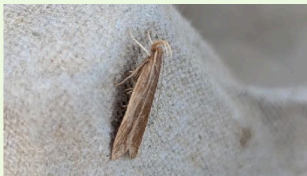
Helcystogramma rufescens