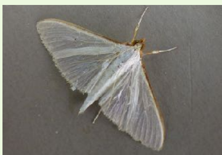
Palpita vitrealis

Brian Hallam from Findern had a good but small catch overnight on 4th in windy conditions, recording Palpita vitrealis (Olive-tree Pearl), Least Carpet , Brown-tail , Nutmeg and Least Yellow Underwing . Another Palpita vitrealis was recorded on 30th June at Midway (iRecord).