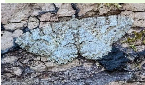
Mottled Beauty

Sid Morris recorded Helcystogramma rufescens and a Small Dotted Buff at Staveley on 2nd. Clive Ashton trapped in local woodland near Cromford on 2nd and recorded 177/35 including 80 Mottled Beauty . Other highlights included Common Lutestring (4), July Highflyer (3), Clouded Magpie (6), Purple Clay (2), Green Arches, Dark Arches, Grey Arches (3) and Buff Arches (9).