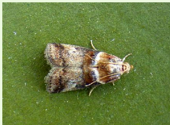
Acrobasis repandana