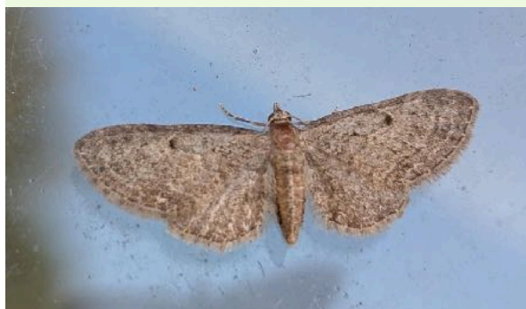
Slender Pug

Nikki Barrow ran her Shirland light trap overnight on 11th, with 64 species including Slender Pug , Pebble Hook-tip , White-spotted Pug and Silver Y . Graham Pollock from Quarndon recorded 261/41 from his garden light trap including Black Arches , Burnished Brass , Campion , Knot Grass and Oak Hook-tip .