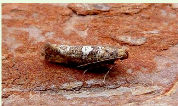
Acrolepiopsis assectella