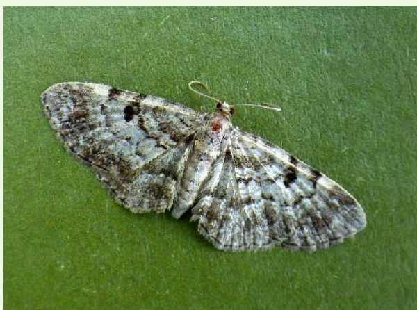
Cloaked Pug - 1st VC57 record

Brian Hallam hit the DMFG headlines with a Bang on the 12th recording Derbyshire's first Cloaked Pug . What a find from his overnight garden light trap on 11th at Findern 254/72. A fantastic pug and already the Derbyshire Pug Guide is now out of date!! What with Pimpinel Pug being re-found a few days earlier and now Cloaked Pug , simply awesome. Brian also had Acrobasis repandana , Slender Pug , Black Arches , Ypsolopha scabrella and Limnaecia phragmitella from the same trapping session.