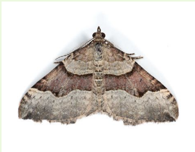
Red Carpet