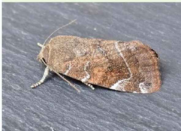
Lesser-spotted Pinion