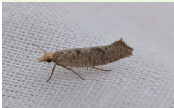
Ypsolopha alpella