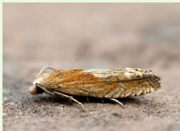
Eucosma cana