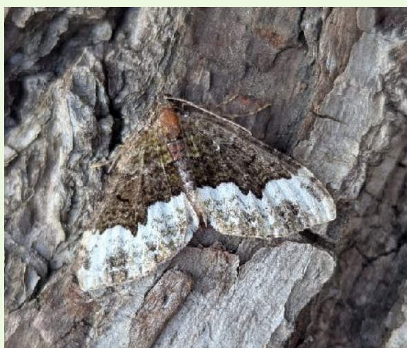
Cloaked Carpet

On the 17th Nikki Barrow ran her light trap at Shirland recording 57 species and at least 450 individual moths. Highlights were Cloaked Carpet , Small Rufous , July Highflyer , Least Yellow Underwing , Drinker and White-spotted Pug .