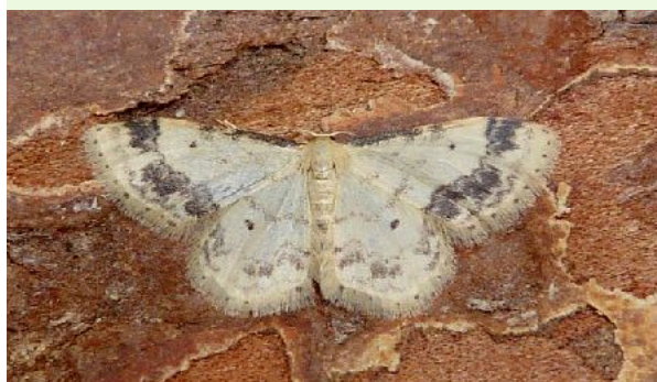
Treble Brown Spot