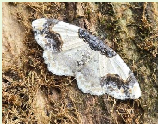
Scorched Carpet

Two Dewick's Plusia were recorded, one from Cromford by Clive Ashton on 25th and another from Belper by Dave Evans on 26th. Are these migrants or do we now have several small localised populations in the county?