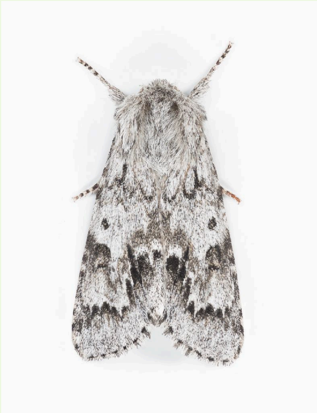
Light Knot Grass