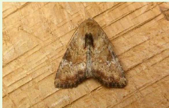
Slender Brindle - Dave Evans©