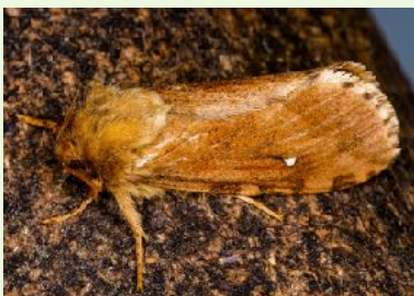
Map-winged Swift - f. gallicus - Ian White©

Overnight on 17th Ian White recorded his best catch ever from his garden in Buxton, in two years of trapping with 152/34. A Map-winged Swift , f. gallicus , Brown China-mark , Cydia fagiglandana and Pammene aurita were all new for his garden list.