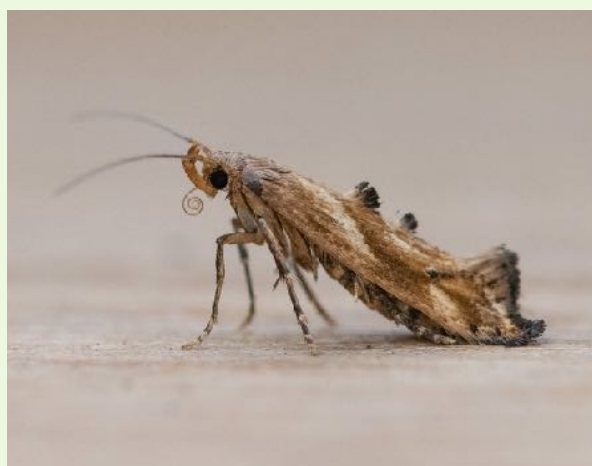
Epermenia falciformis