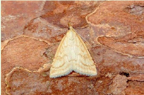
Udea lutealis - Dave Evans©