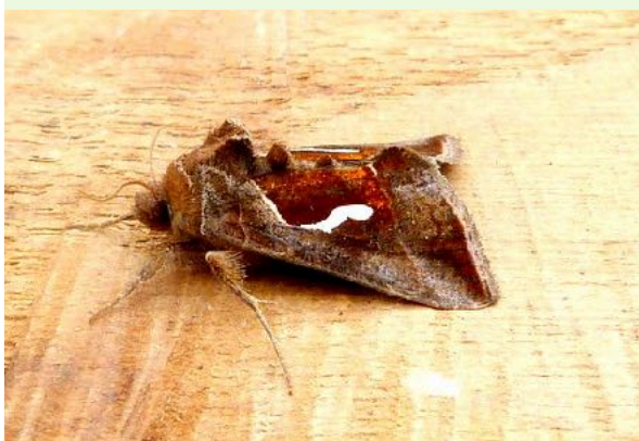
Dewick's Plusia