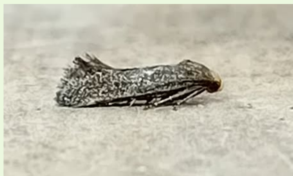
Apodia martinii