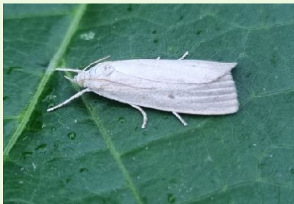
Calamotropha paludella

July Moth News - Another good catch from Belper when Dave Newcombe recorded 410/89 from his garden light traps on 17th. Highlights were Calamotropha paludella , and Twin-spotted Wainscot , both reed bed species.