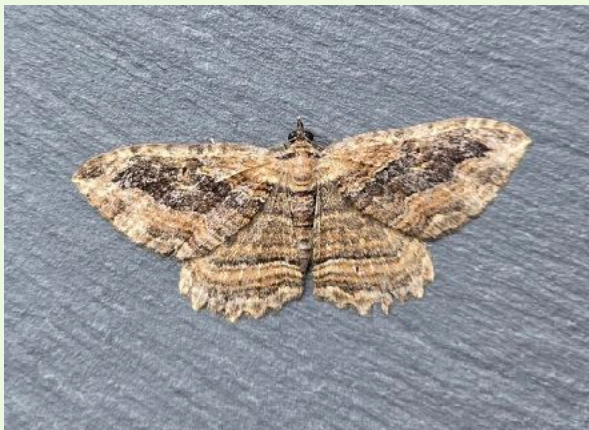
Dark Umber - Clive Ashton©

Anne Butler recorded 11 Tree Lichen Beauty , Black Arches , Dusky Thorn (4) and Canary-shouldered Thorn on 17th at Sandiacre. Also on 17th Clive Ashton from Cromford ran his garden light trap and recorded a few worth mentioning, Dark Umber , Juniper Pug , Red Twin-spot Carpet and a late Bird's Wing .