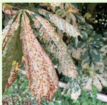
Horse Chestnut Leaf-miner