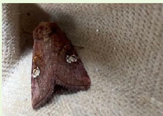
Ear Moth agg