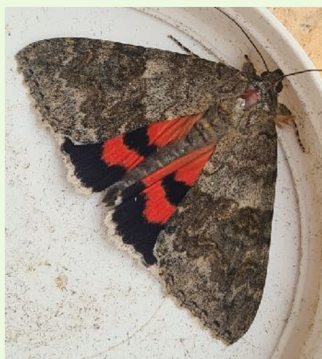
Red Underwing - Brian Hobby©