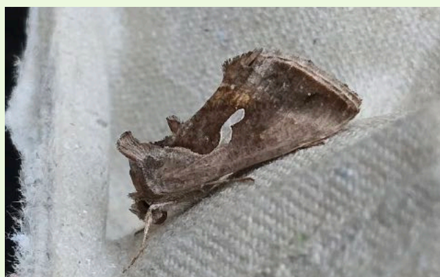
Dewick's Plusia