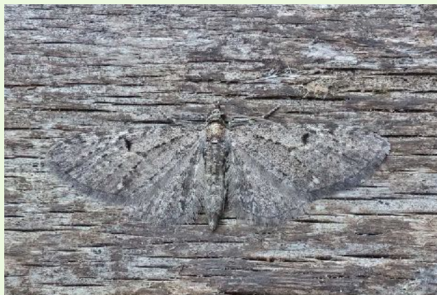
Golden-rod Pug

July Moth News - I ran my Melbourne garden light trap overnight on 19th recording 194/41 which included highlights of Golden-rod Pug , Dusky Sallow , Turnip (2) Catoptria falsella , Maiden's Blush , Phoenix and Small Phoenix .