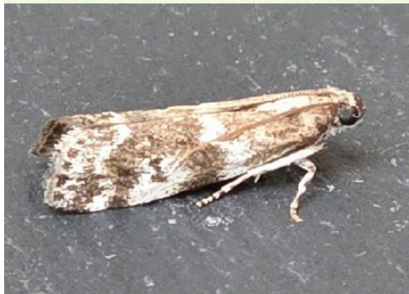
Assara terebrella - Clive Ashton©

July Moth News - Clive Ashton was another recorder who had a massive catch from his Cromford garden light trap on 18th with 550/81 and a few highlights of Straw Underwing (2), Dusky Thorn (4), Barred Carpet , Coxcomb Prominent , Pinion-streaked Snout , Plutella poroctella , Acompsia cinerella , and Assara terebrella , the second record for Derbyshire and the first since 2021.