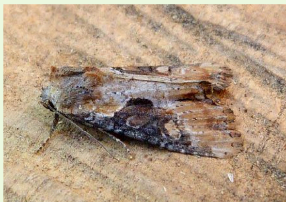
Double Lobed - Dave Evans©