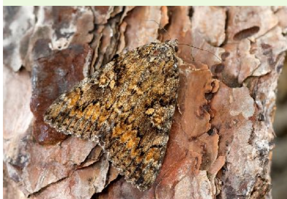
Dark Crimson Underwing