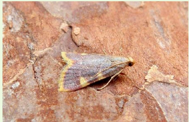
Hypsopygia costalis