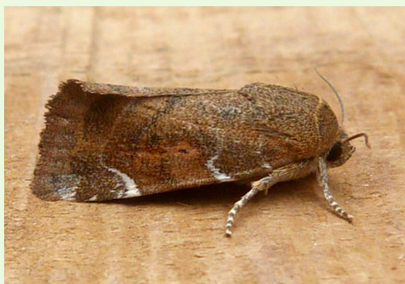
Lesser-spotted Pinion