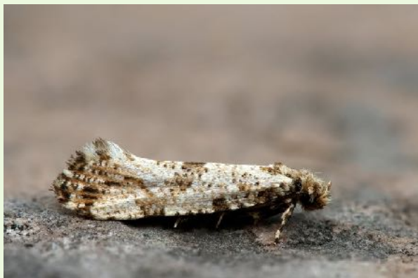
Morophaga choragella