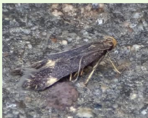
Eulamprotes atrella