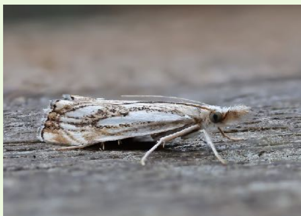
Caloptilia falsella

Several more recorders ran traps on 19th including Emily Milnes from Sandiacre, 250/48 included Bordered Pug , Bulrush Wainscot , Tree Lichen Beauty (2) , and a female Ringed China-mark .