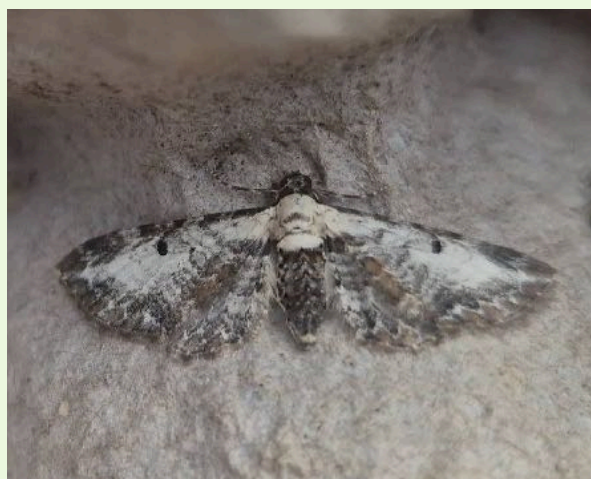
Bordered Pug

Several more recorders ran traps on 19th including Emily Milnes from Sandiacre, 250/48 included Bordered Pug , Bulrush Wainscot , Tree Lichen Beauty (2) , and a female Ringed China-mark .