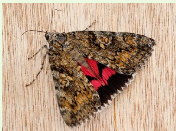
Dark Crimson Underwing