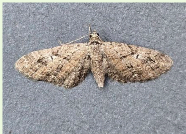
Juniper Pug