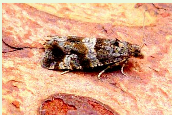
Lobesia abscisana