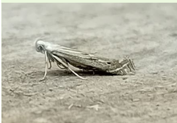
Isophrictis striatella