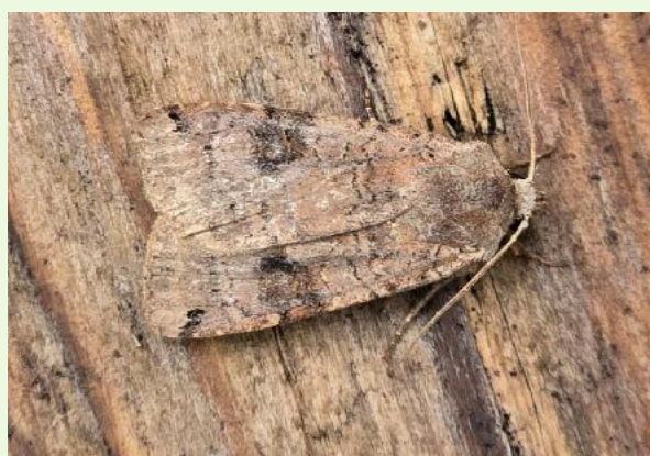
Dotted Clay

Following torrential rain during the night of the 20th, Clive Ashton came back down to earth with a catch of 37/25 from his Cromford garden, though he still managed a few decent moths, Iron Prominent , Yellow-tail , Dotted Clay and Slender Brindle .