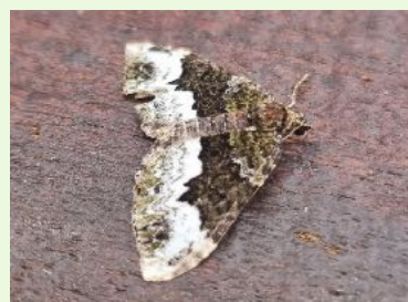
Cloaked Carpet