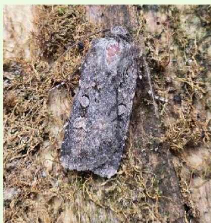
Garden Dart - Clive Ashton©