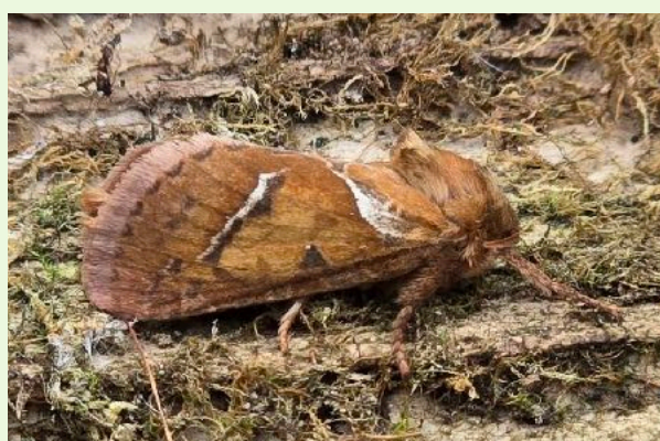
Orange Swift - Clive Ashton©

Other highlights from Clive Ashton's moth trap at Cromford on 25th were Orange Swift , Small Rufous and another Garden Dart . Graham Pollock from Quarndon recorded 106/34 on 25th, including a Ringed China-mark , Copper Underwing aggregate and Agapeta hamana .