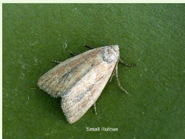
Small Rufous - Brian Hallam©

July Moth News - Brian Hallam at Findern had a good catch on 17th recording Small Rufous , Golden-rod Pug , Maple Pug , Small Phoenix and Twin-spotted Wainscot .