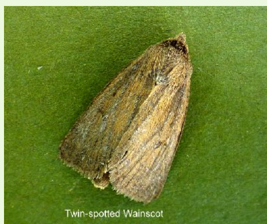
Twin-spotted Wainscot