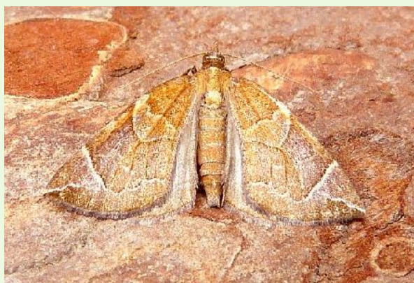
Chevron