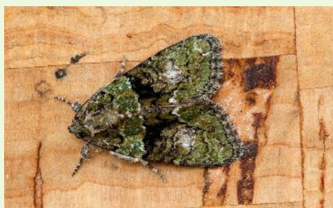
Tree Lichen Beauty - Martin Roome©