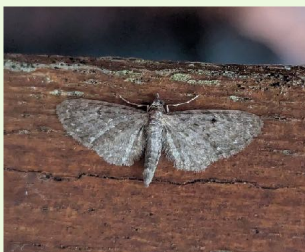
White-spotted Pug - Nikki Barrow©