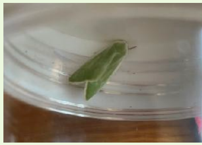
Cream-bordered Green Pea - Neil Ward©

Coming to the end of the month and the final trap results - Clive Ashton 29th from Cromford a Grey Chi , Narrow-winged Pug , Dotted Clay , a female Orange Swift and a late Bird's Wing . Some really nice moths from Clive. Dave Newcombe from Belper on 29th had 164/56 with highlights of Tree Lichen Beauty , Burnished Brass , Maiden's Blush , Campion and Pebble Hook-tip .