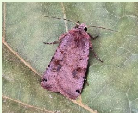
Dotted Clay - Clive Ashton©

Brian Hallam hit the DMFG headlines with a Bang on the 12th recording Derbyshire's first Cloaked Pug . What a find from his overnight garden light trap on 11th at Findern 254/72. A fantastic pug and already the Derbyshire Pug Guide is now out of date!! What with Pimpinel Pug being re-found a few days earlier and now Cloaked Pug , simply awesome. Brian also had Acrobasis repandana , Slender Pug , Black Arches , Ypsolopha scabrella and Limnaecia phragmitella from the same trapping session.