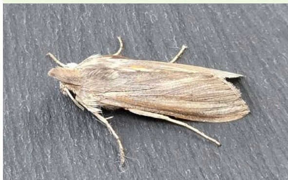
Shark - Clive Ashton©

July Moth News - On 4th Clive Ashton at Cromford recorded 126/52 in windy conditions, including Shark , White Satin , V-Pug (4), Early Thorn (5), V-Moth (2) and Scalloped Oak (5).