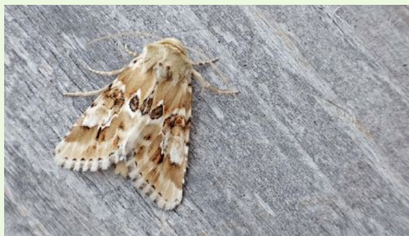
Dusky Sallow - Tony Davison©

I ran my Melbourne garden light trap on 13th and recorded one of the best catches I've ever had in over 20 years trapping here - 218/70 - highlights were Caloptilia robustella , Crassa unitella , Catoptria pinella , Metalampra italica , Eucosma conterminana , Large Tabby, Lychnis, Least Carpet (6), Vapourer, Least Yellow Underwing and Dusky Sallow.