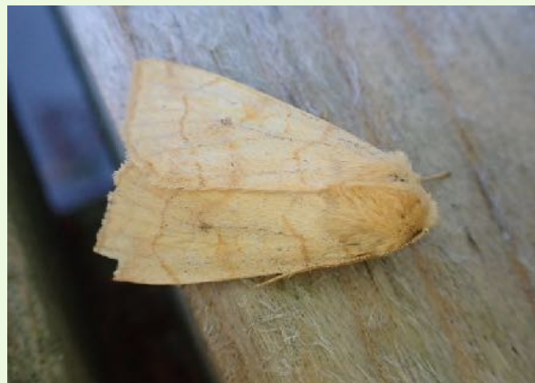
Angle-striped Sallow - Pete Mella©