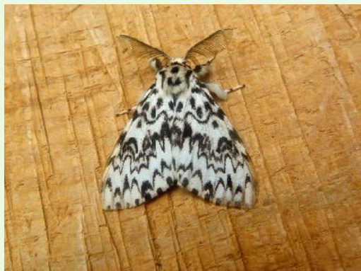
Black Arches - Dave Evans©