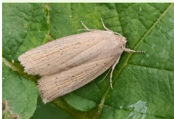
Silky Wainscot