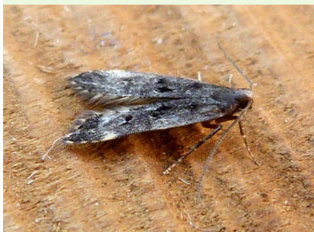
Dichomeris alacella 1st VC57 record