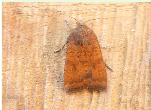
Least Yellow Underwing