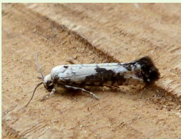
Prays fraxinella