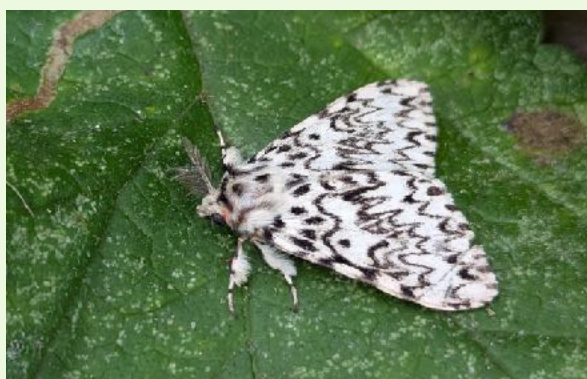
Black Arches - Nikki Barrow©