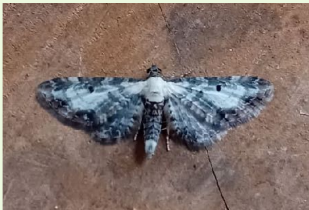
Bordered Pug