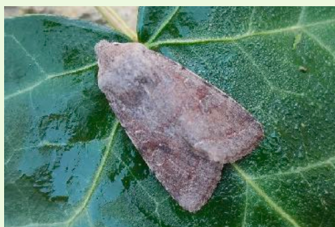
Clouded Drab