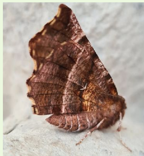
Early Thorn