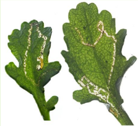
Bucculatrix nigricomella