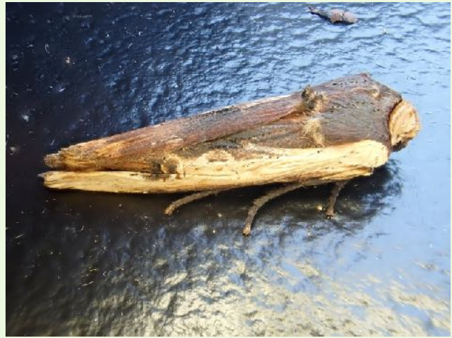
Red Sword-grass