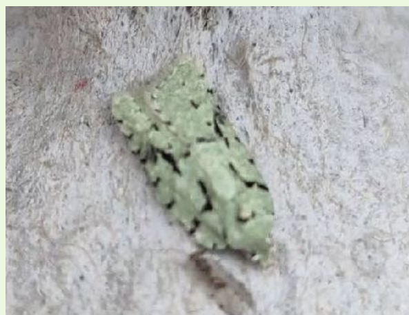
Acleris literana - Emily Milnes©

Also on 21st Adrian Watson recorded 46/10 from 2 x20W Skinner Traps at Lea, Matlock, including 2 Yellow Horned , 3 Chestnut , 6 Clouded Drab , 2 Red Chestnut , 2 Shoulder Stripe and 2 Twin-spotted Quaker .