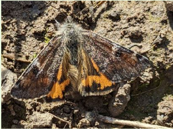
Orange Underwing - Malcolm Tait©

Malcolm Tait had an Orange Underwing at Moss Valley on 27th