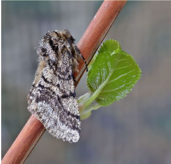
Brindled Beauty

Several moth traps were running on 31st including mine in Melbourne and similar species were recorded, including Clouded Drab , Brindled Beauty and Early Thorn .