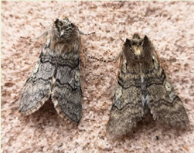
Yellow Horned