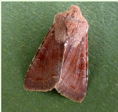
Clouded Drab