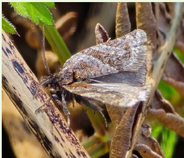
Philedonides lunana