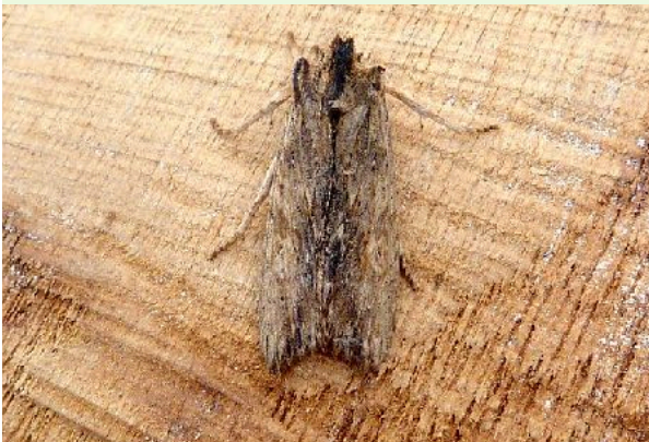
Tawny Pinion - Dave Evans©

Bringing the month to a close, Clive Ashton had 10/5 from his Cromford garden moth trap overnight on 31st, including a Pine Beauty and Emily Milnes from her Sandiacre garden moth trap recorded 18/5 including Double-striped Pug and Early Grey