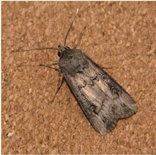
Dark Sword-grass - Clive Ashton©