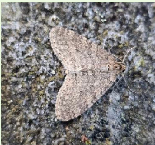
Early Tooth-striped

On 25th Clive Ashton ran a light trap at Cromford Moor on 25th recording some good species including the first Early Tooth-striped for the year, Chestnut (2) and Eriocrania subpurpurella agg.