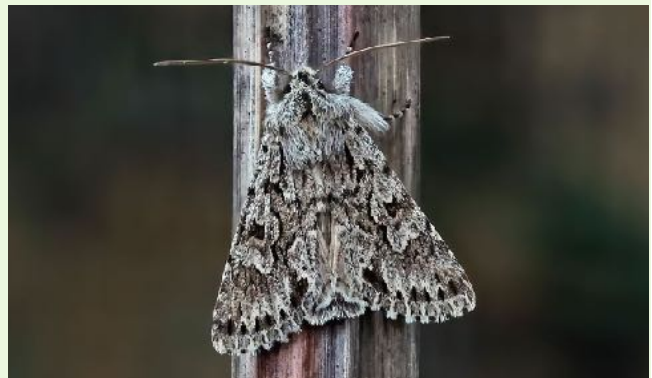
Early Grey