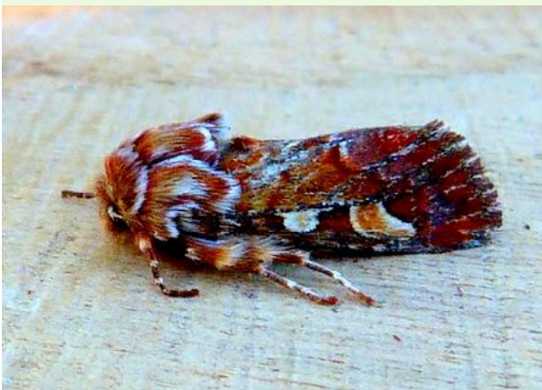
Pine Beauty - Dave Evans©