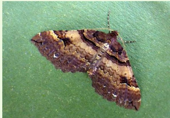
Shoulder Stripe