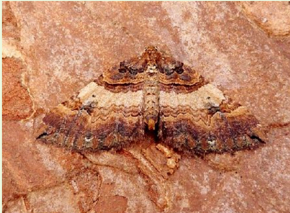
Shoulder Stripe - Dave Evans©