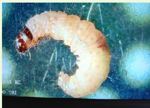
Endothenia marginana