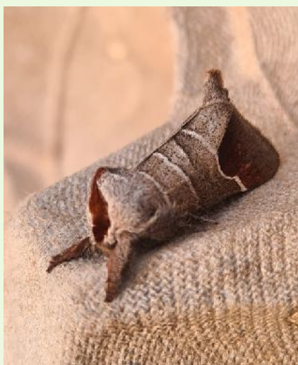
Chocolate-tip