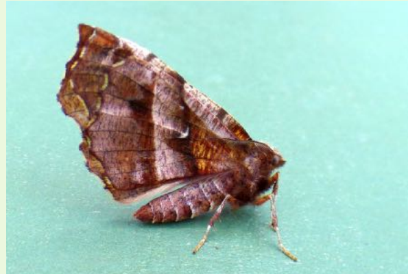
Early Thorn