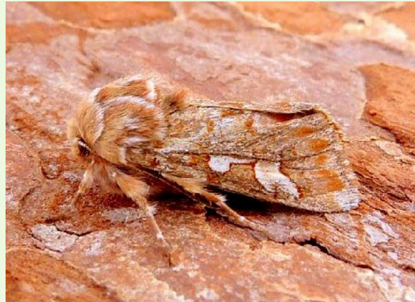
Pine Beauty - Dave Evans©

Sid Morris recorded an Orange Underwing in flight at Markham Vale on the morning of 20th.