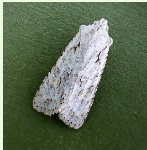
Grey Shoulder-knot