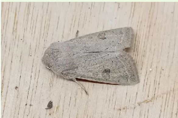
Powdered Quaker