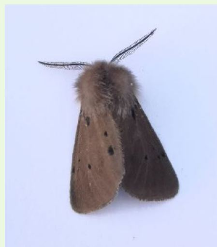
Muslin Moth