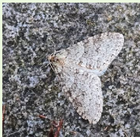
Early Tooth-striped - Clive Ashton©