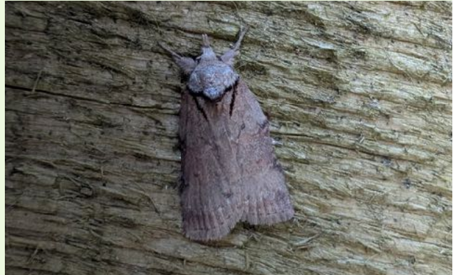
Oak Nycteoline

Steve Thorpe ran his garden light trap at Breaston on 7th and had 8 moths of 6 species including a Pale Pinion , Oak Nycteoline and Agonopterix subpropinquella . Clive Ashton had an Engrailed on 9th from his light trap at Cromford.