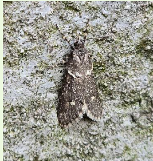
Diurnea fagella