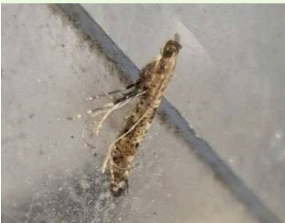
Caloptilia populetorum