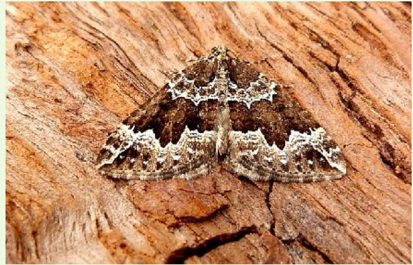
Water Carpet