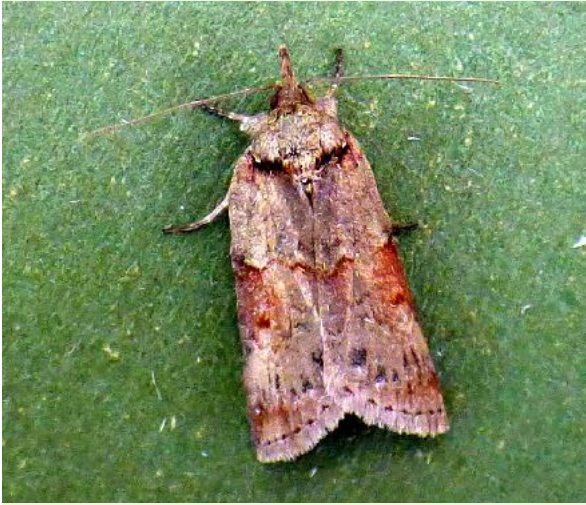
Oak Nycteoline