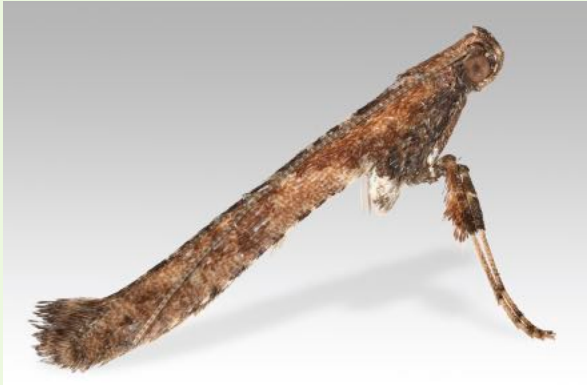
Caloptilia falconipennella