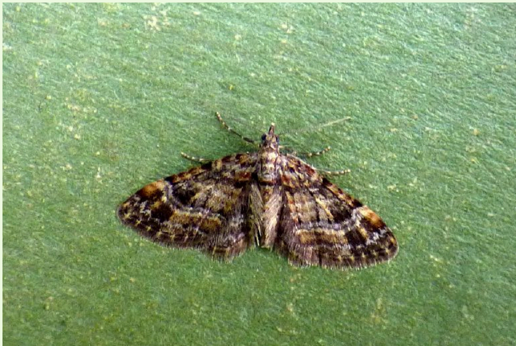
Double-striped Pug

A stunning Double-striped Pug from Brian Hallam's light trap at Findern on 9th.