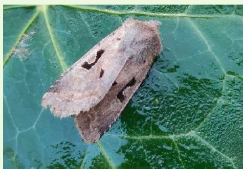
Hebrew Character