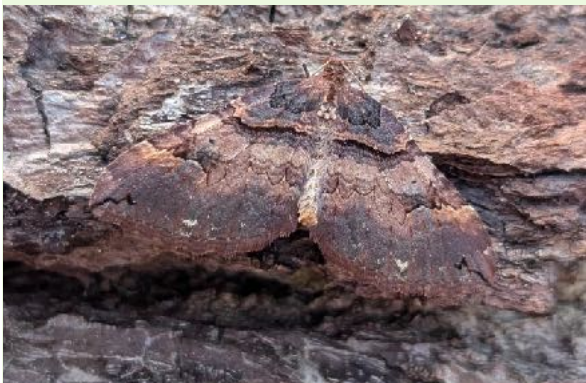
Shoulder Stripe