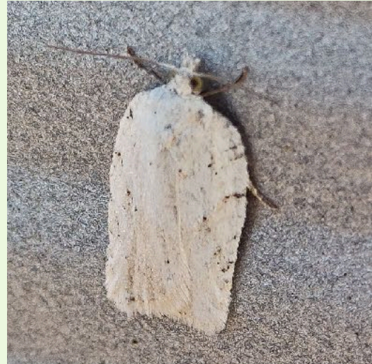
Acleris logiana