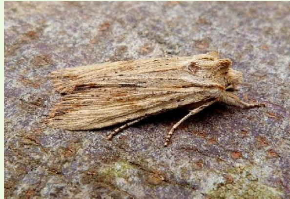
Pale Pinion - Dave Evans©