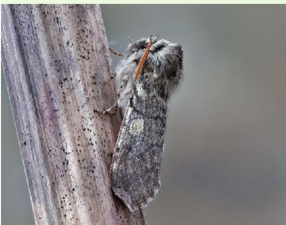
Yellow Horned