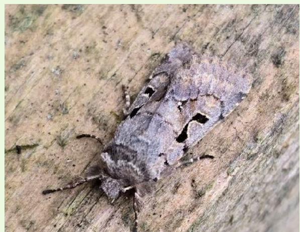
Hebrew Character - Clive Ashton©