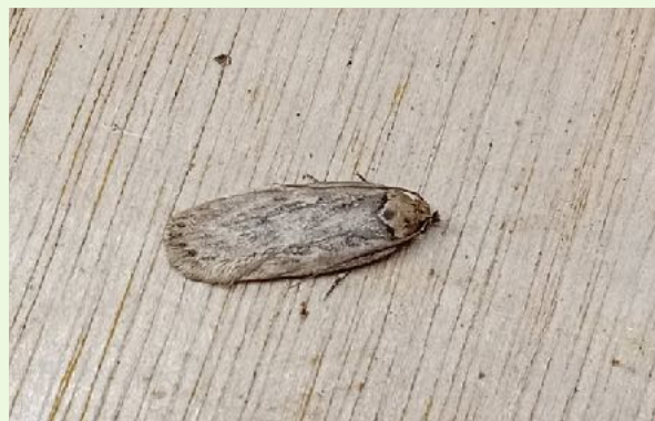
Depressaria radiella