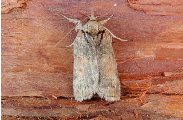
Oak Nycteoline