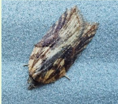
Acleris hastiana