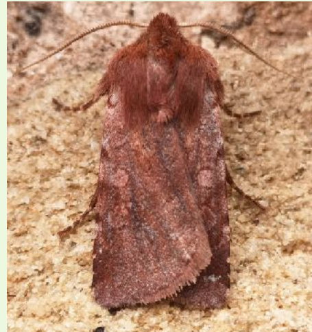
Red Chestnut