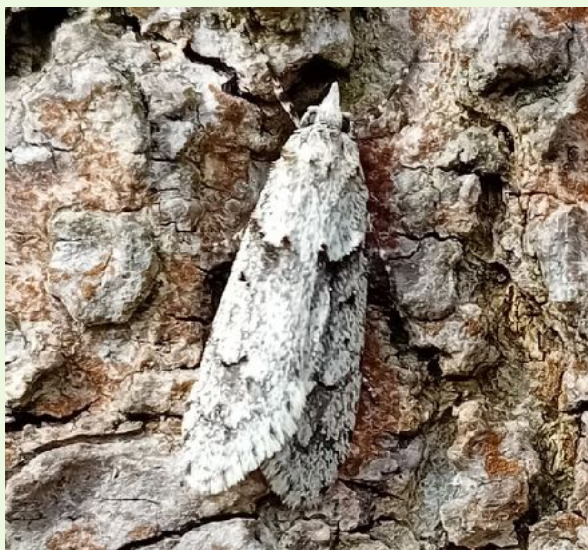
Diurnea fagella