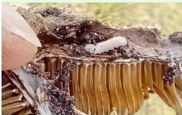
Endothenia marginana