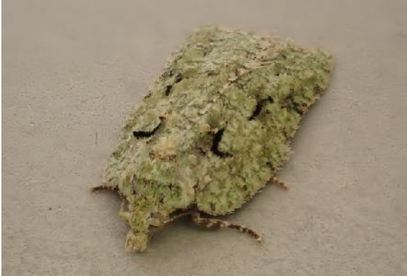
Acleris literana - Steve Orridge©

Steve Orridge stated that his Buxton garden is over 1000ft above sea level and so March is generally a quiet time for moth trapping. However he ran his garden moth trap overnight on 20th recording 5 species including 7 Common Quaker , an Oak Beauty , an Acleris literana and a likely Caloptilia betulicola which unfortunately is a CAT 4 and requires closer examination and needs to be recorded as an aggregate.