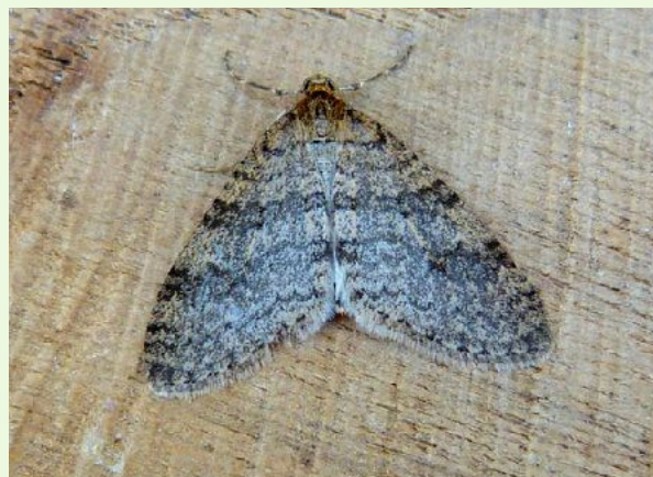
Early Tooth-striped

Well that brings to a close the March 2025 edition of Moth News for Derbyshire. Some interesting recordings including the new micro moth species Caloptilia falconipennella , a great start to the new season ahead. Thanks to all the recorders who have submitted their 2024 records to iRecord, much appreciated.