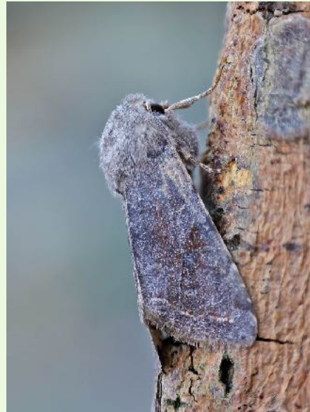
Clouded Drab